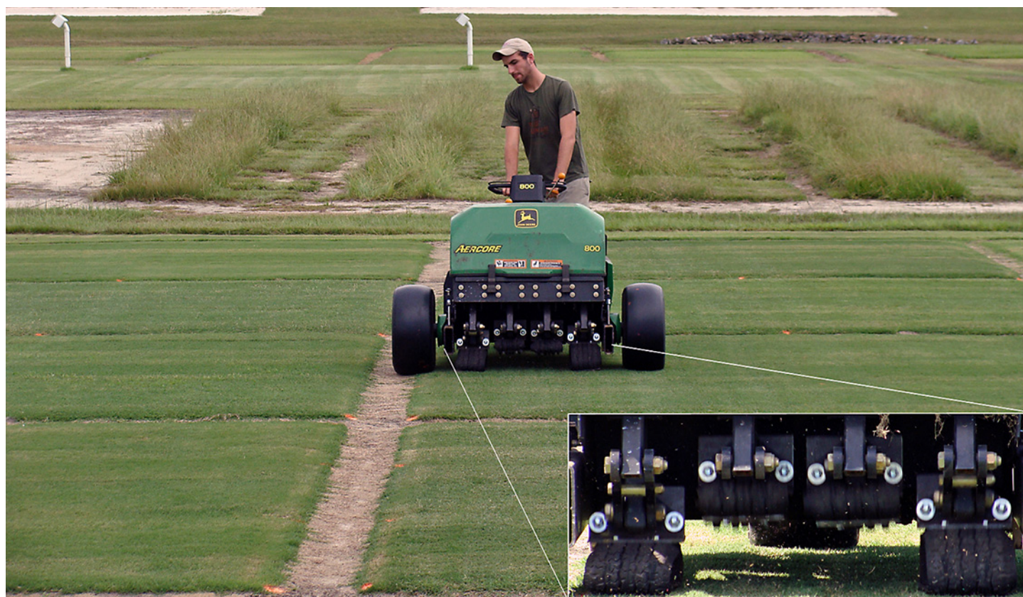
A modified Cady traffic simulator was used to apply traffic once per week during the study period.