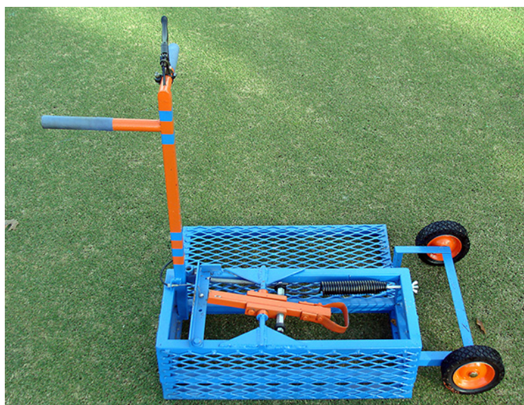
Designed and constructed at the University of Florida, a specialized divot machine was used to produce uniform divots on each plot.

Data have shown that under no traffic, Floratex and T11 recovered from divot damage faster than all other cultivars during the first two weeks. In plots receiving traffic, Celebration, Floratex, Hybrid1, Riviera, and T11 all performed similarly and all recovered faster than Tifway, TifSport, and