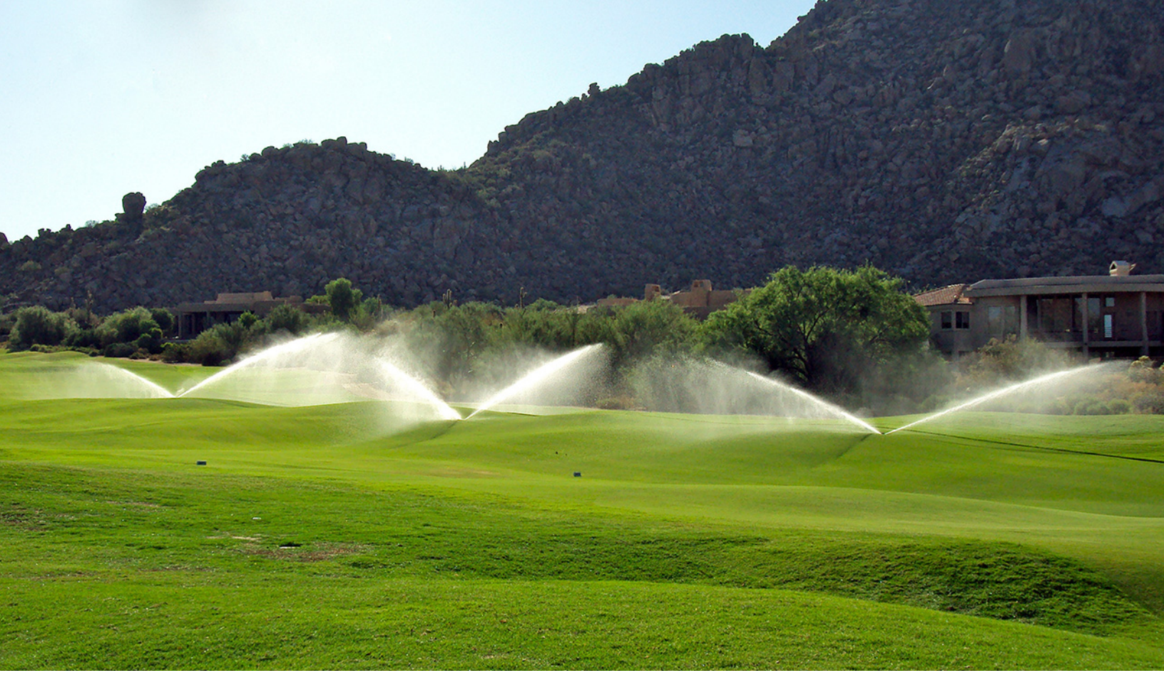
In the desert southwest, where irrigation water often contains high sodium levels, it is imperative that agronomic programs are based on accurate soil data.