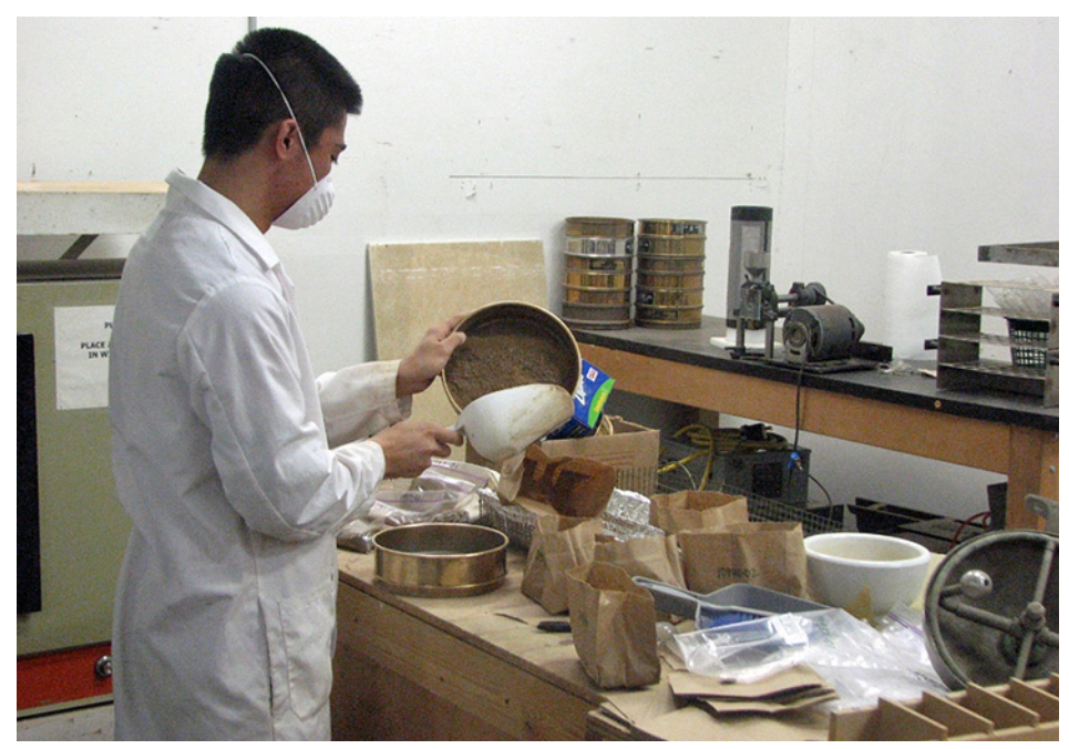
A "universal" extracting solution is not currently available, so turf managers must choose the right extractant for the soil type at their courses.

wide variety of soil types, but as of right now, the only commercially available extractant suitable for alkaline, calcareous soils is the elevated pH ammonium acetate extractant. Early in this article the question was raised whether you would change to a more accurate soil testing method. If you have made it this far, you likely