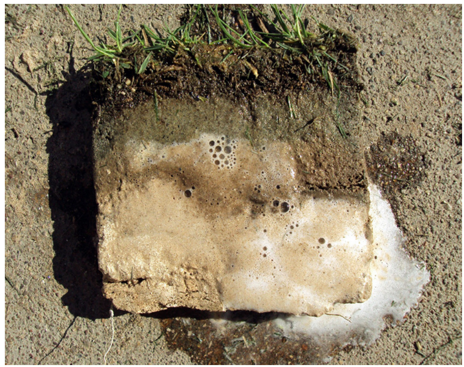
When acid is placed on a soil containing appreciable calcium carbonate, the soil fizzes in the form of carbon dioxide gas bubbles.

and to a lesser extent magnesium (Mg). For example, when the pHneutral ammonium acetate extractant is used on a calcareous soil, it may overestimate Ca by as much as 60% (3). In another example, the pH 7.0 ammonium acetate procedure may yield up to 40% more calcium than is actually available for plant use and exchange for sodium (Na) in the soil (2). Overestimating Ca levels in the soil not only affects Ca, but will cause inaccurate estimates of CEC, base saturation levels, and cation ratios, and will underestimate the exchangeable sodium percentage (ESP).