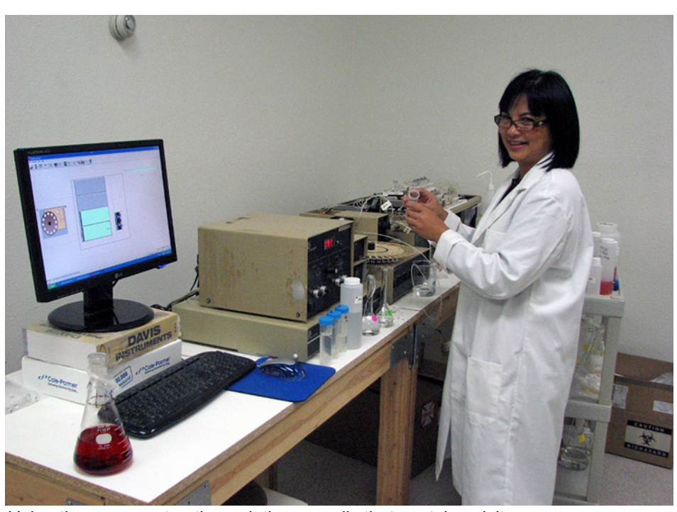
Using the wrong extracting solution on soils that contain calcite or gypsum can underestimate fertilizer and soil amendment requirements.

Research is needed to develop new extractants that are suitable for a