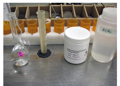
Different soil testing methods are used to determine the total nutrients in the soil, the available nutrients, and those in the soil solution. These three extracting methods are often confused.

Mike Rothenberg, a soil consultant for Brookside Laboratories, encourages turf managers in the Southwest to use the elevated pH ammonium acetate extractant. Mr. Rothenberg stresses the importance of testing the soil to confirm the presence of calcite prior to recommending a change in soil testing procedure. Over the last few years, Mr. Rothenberg noticed that when superintendents changed to the correct extractant, they were always surprised to see the Ca levels decreased and the sodium percentage increased. Many realize they need to modify their Na reduction program to address the correct values. Let's take a look at a few examples where turf managers in Arizona have realized the benefits of accurate soil test data.