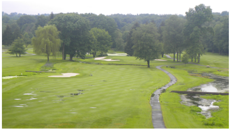
Puddling is disruptive to play and can have long-lasting impacts on the condition and quality of playing surfaces.