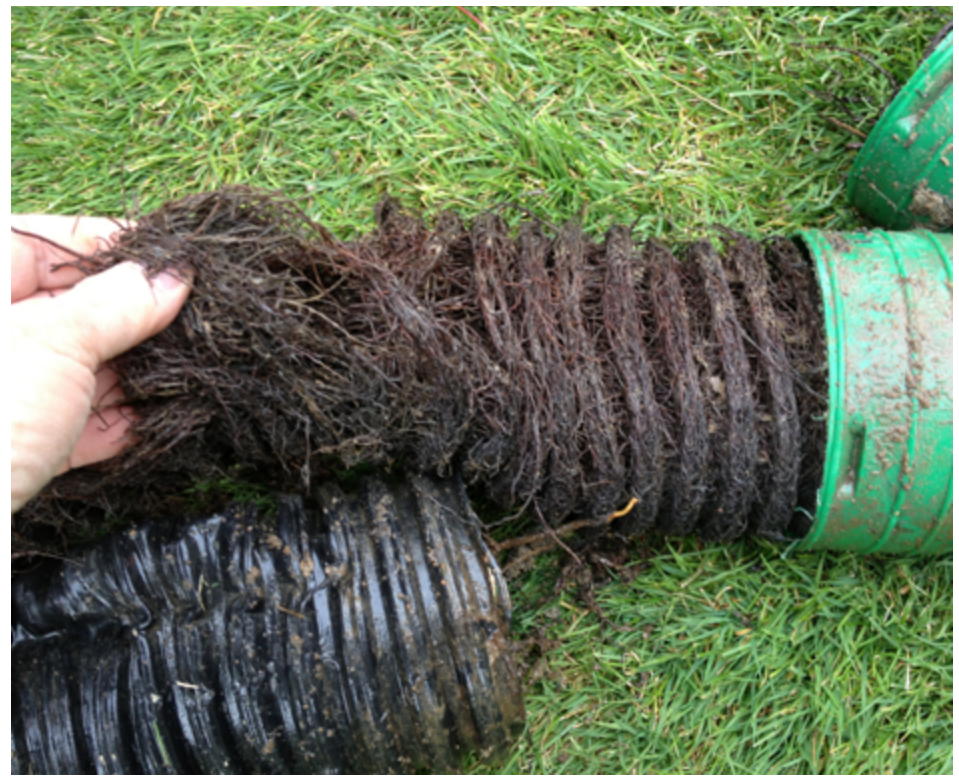
Tree roots can quickly clog a drain pipe, rendering it ineffective. Solid pipes with sealed joints are recommended near trees with aggressive root systems. In these areas, surface inlets can be used to capture surface water where necessary.

Hurley, Dennis. "Analyzing Drainage Problems. Part 2." Hole Notes August 2009: 16.