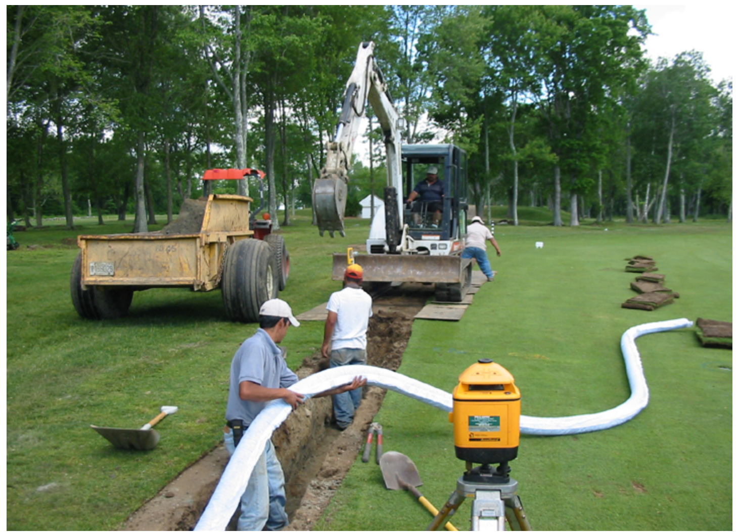
Workers install a 4-inch, wrapped, perforated pipe while a small excavator digs the drainage trench. The trench is checked with a grade laser to ensure a consistent slope. Note that the excavator operates on plywood to avoid damaging the playing surface.

should be frequently checked during installation. If necessary, sand or gravel can be used to create a smooth and uniform trench bottom prior to installing the drain line. However, bedding drainage pipe in a layer of sand or gravel is not necessary.