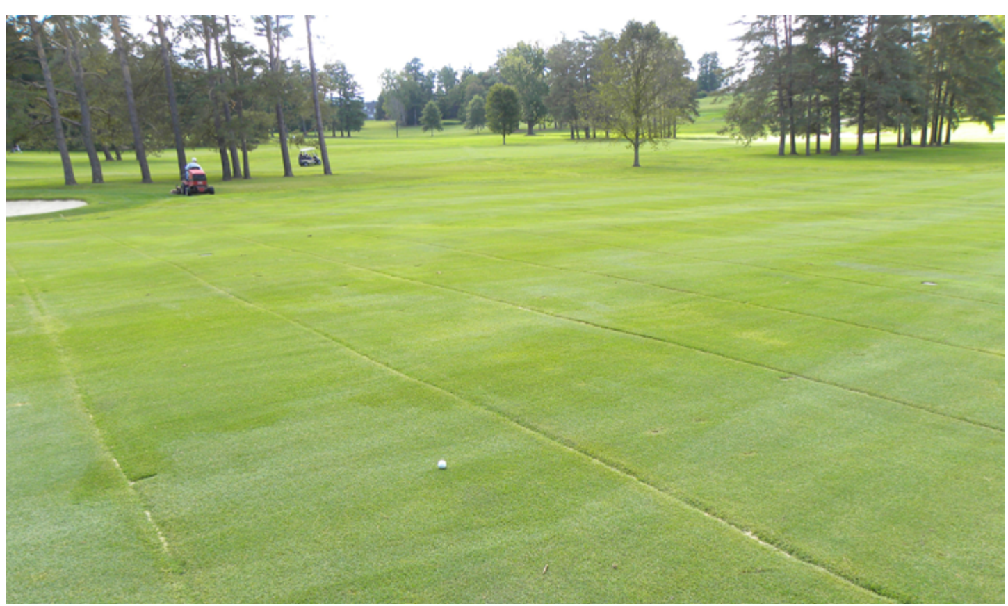
Only a few months after installation, turfgrass has nearly covered the trenches of a slit drainage system. This system follows a grid pattern and utilizes 2-inch, perforated, wrapped pipes in a sand envelope.

Most drainage engineers and specialists recommend using geotextile-wrapped pipe encased in sand for subsurface drainage projects. Using sand and fabric together creates a stable system in virtually all soil types, extending the performance and work-