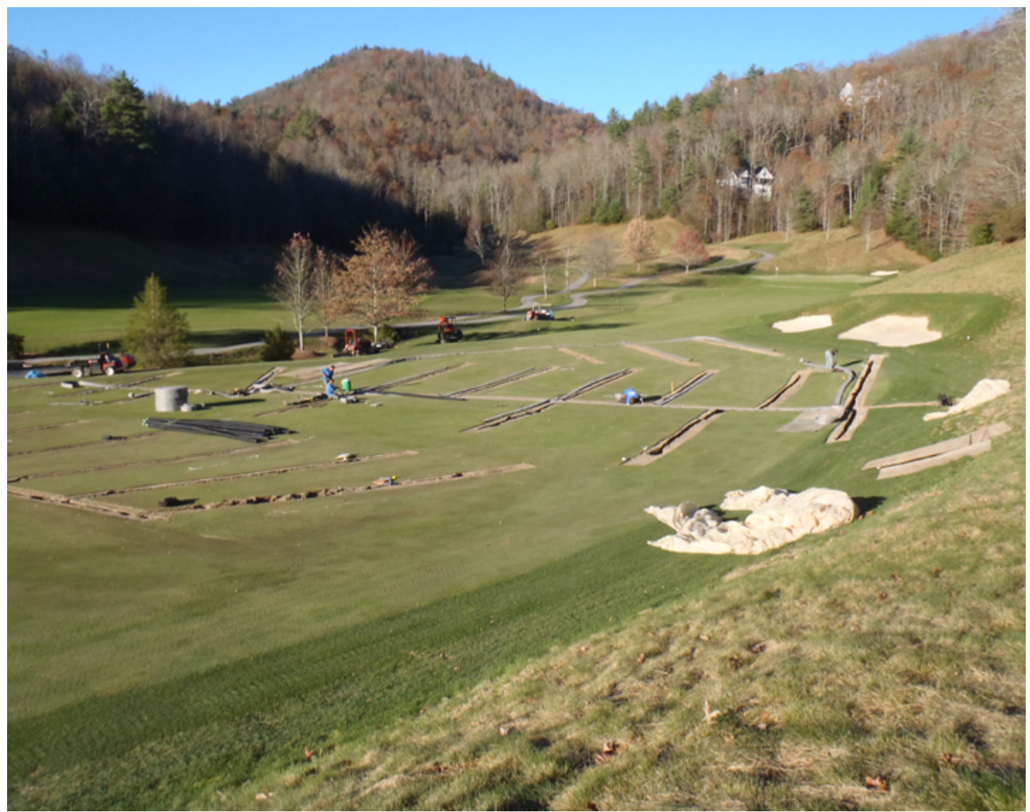
Extensive drainage improvements may need to be done in phases, so proper planning is essential.

their evaluation of existing drainage infrastructure, surface contours, soil conditions, and estimates of water flow onto and off the golf course.