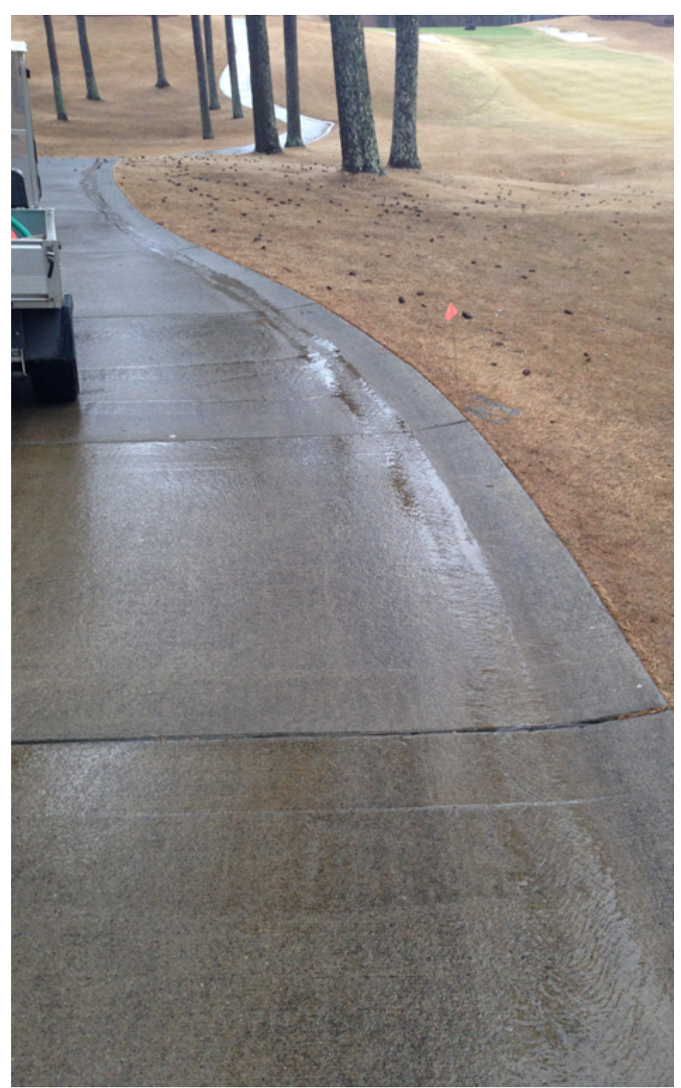
Curbing along a cart path can collect surface water and divert it away from playing areas.

©2016 by United States Golf Association. All rights reserved. Please see Policies for the Reuse of USGA Green Section Publications. Subscribe to the USGA Green Section Record.