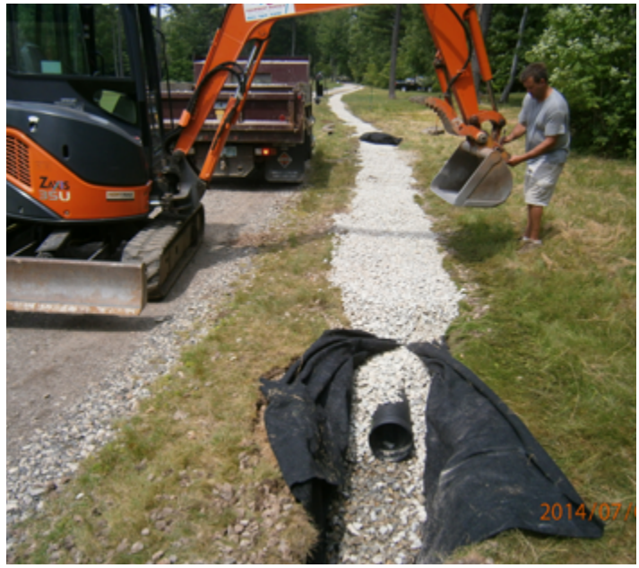
Surrounding a gravel envelope with non-woven geotextile fabric will prevent fine soil particles from migrating into the gravel and perforated pipe.