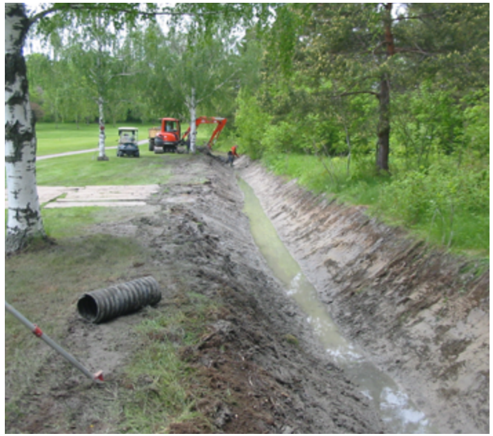
Cleaning open ditches to reestablish water flow maintains a good outlet for subsurface drains and speeds water flow through the property.

ing life of the drain lines. It is important to note that not all geotextile fabrics are the same. Knitted or non-woven geotextile fabrics are strongly recommended over woven alternatives. In addition, wrapped pipe should never be installed in a wet trench where more than 0.125 inch of the pipe is under water during installation. Backfill sand should immediately be placed in direct contact with a dry, wrapped pipe to ensure a long life.