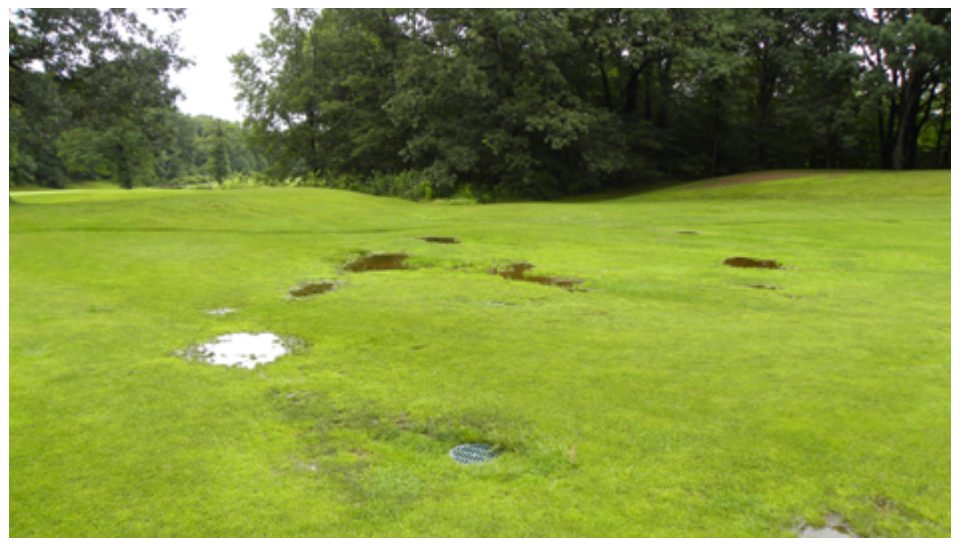
Standing water above a sunken drain line is a good indication that the pipe has failed and needs to be replaced.