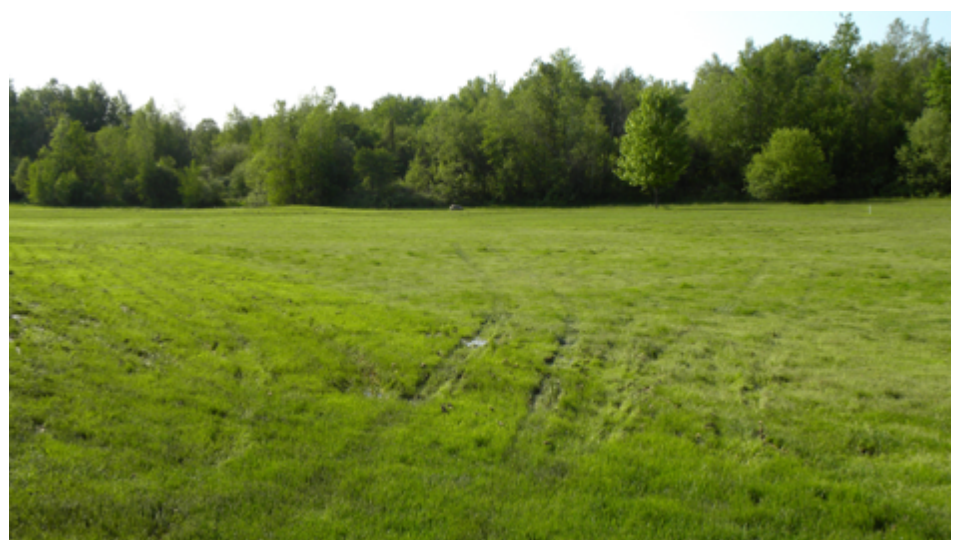
The combination of impermeable soils and runoff from a neighboring property can leave areas too wet for mowing or golf during wet weather.

©2016 by United States Golf Association. All rights reserved. Please see Policies for the Reuse of USGA Green Section Publications. Subscribe to the USGA Green Section Record.