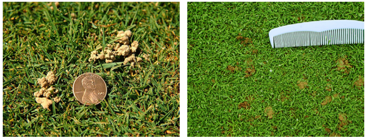
Dry and muddy compacted earthworm castings on a push-up putting green.

xcessive earthworm casts are a worldwide problem on golf courses and sport fields when they disrupt the playability, aesthetics, and maintenance of playing surfaces (3, 6, 11). Casting occurs when worms deposit their soil-rich fecal matter as small mounds, called casts, on the surface. They adversely affect ball roll and muddy and smother the grass when smeared or compacted by tires or foot traffic. In 2009 the Sports Turf Research Institute rated earthworms the number-one problem about which they receive queries.