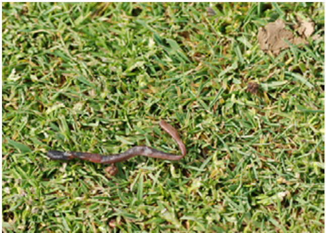
Dried-up earthworm a few hours after treatment.