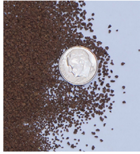
Crude tea seed pellets (left) and Early Bird fertilizer (right). Note the fine granule of the fertilizer product.