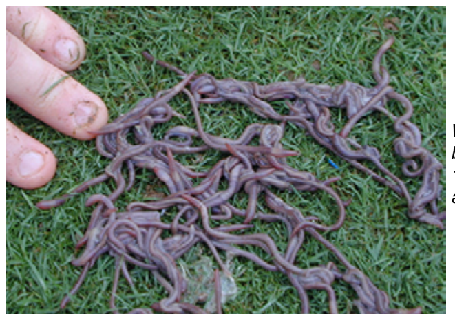
Worms expelled by TSM from 1 square meter on a push-up green.