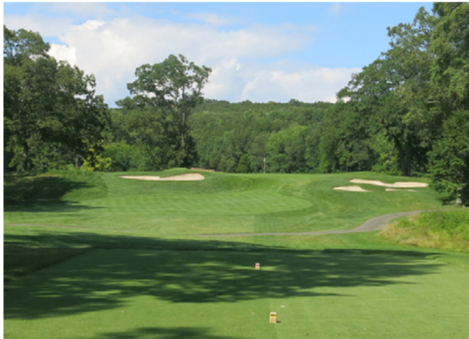
The difference in a golfer's perceived difficulty of a golf hole with and without a backdrop of trees is remarkable. Once a backdrop is removed, a green looks smaller, the topography comes alive and the hole looks much more challenging.

Several famous golf course architects commented or wrote about trees. The following A. W. Tillinghast quote, from the book titled The Course Beautiful , encapsulates his opinion of trees used as backdrops behind greens: "... in the case of a green played directly beyond the slope of a hillock and sharply defined against the sky. Barren of any nearby object, such as a tree for instance, the distance of