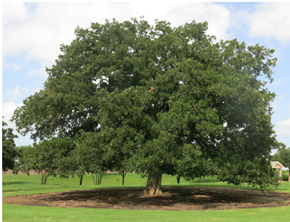
There are few things more majestic than a properly located, stand-alone specimen tree. It is remarkable what a small tree can become with care and foresight.

Poorly located trees forced golf holes out of alignment by narrowing playing corridors and reducing lines of play. Golf holes that were originally intended to provide golfers with multiple lines of play became so choked with trees that often only one option