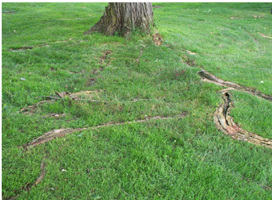
Some tree species have extremely aggressive root systems. Above-ground surface roots are a menace to maintenance equipment, golf carts, and golfers.

There are both appropriate and inappropriate tree species for use on golf courses and in fine turf areas, so