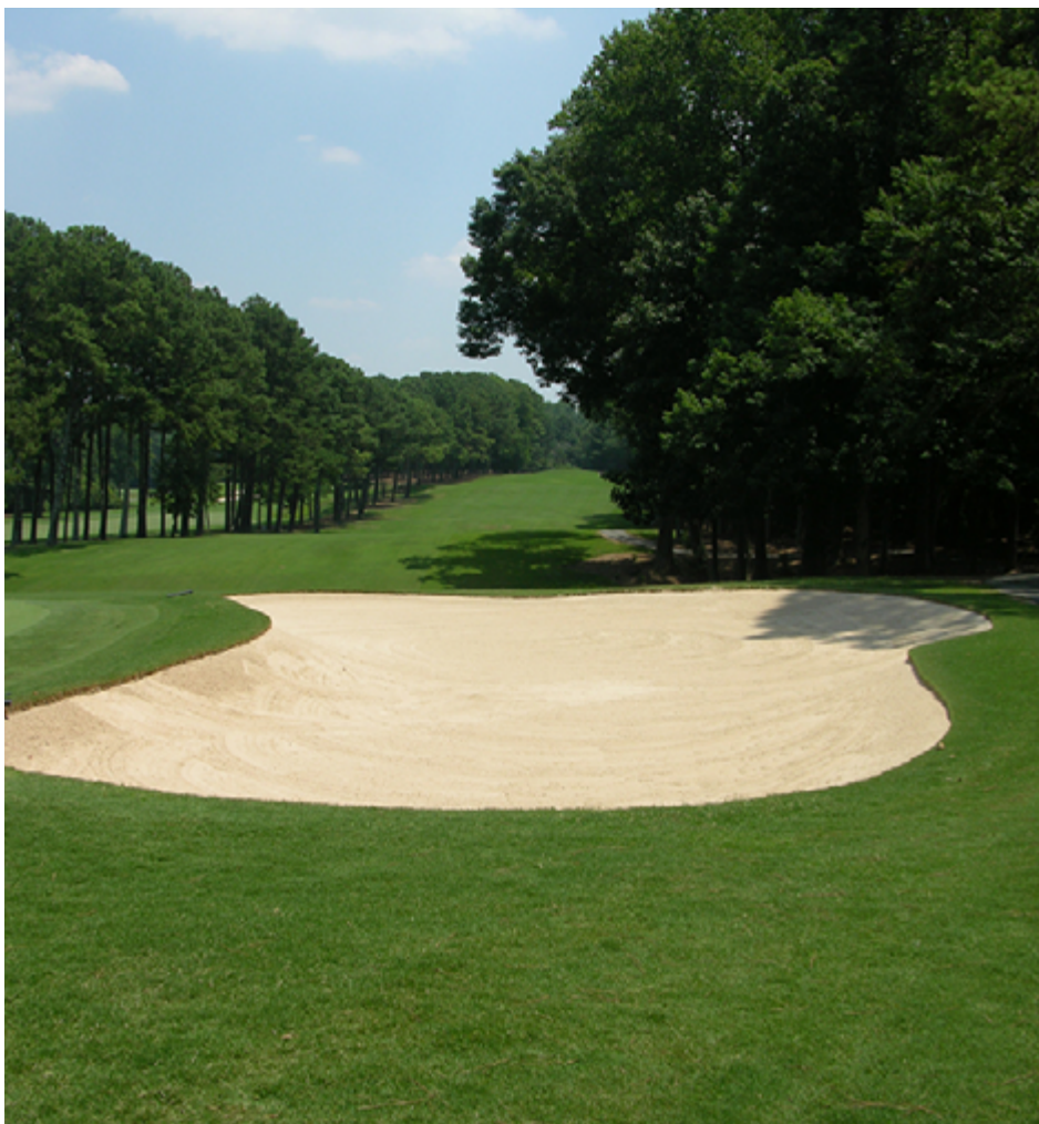
Trees that block advancement from a bunker doubly penalize a miss-hit shot and are termed “double hazards.” For most, golf is a difficult enough game and to penalize a wayward shot so severely just adds insult to injury.