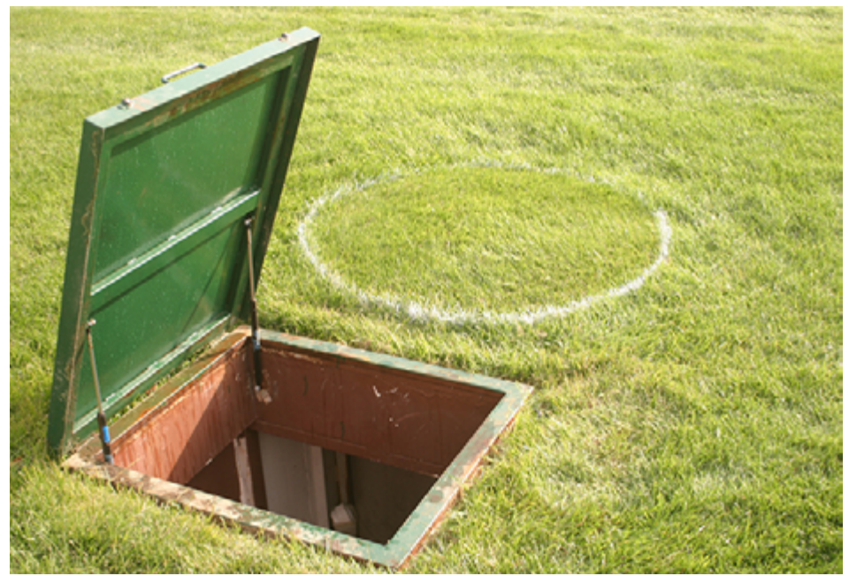
Lysimeters were installed at the Michigan State University Hancock Turfgrass Research Center from 1989 to 1991. Plots have been continuously fertilized for 21 years, and leachate has been analyzed for nitrate-nitrogen since 1998. Leachate analysis revealed that levels of nitrate-nitrogen in the leachate can be reduced by lowering the application rates of nitrogen fertilizers, but such leachate reductions may take five years or more before acceptable levels are achieved.

Nitrogen mineralization is the process by which nitrogen that is incorporated into organic matter (plant roots and shoots, soil microorganisms, thatch, etc.) is converted back into inorganic nitrogen. When plants, animals, and soil fauna and flora die, the decay process releases organic nitrogen as ammonium (NH<sub>4</sub>+). Plants can absorb the ammonium again or