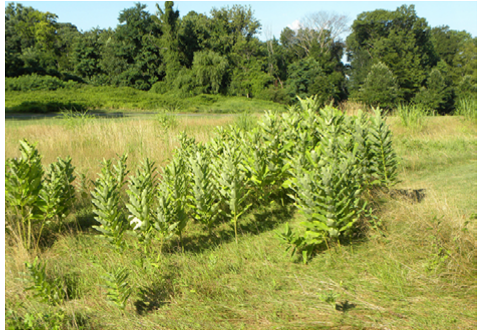
Milkweed is allowed to grow in certain areas because it is a good food source for monarch butterflies.

ADAM MOELLER is an agronomist in the USGA Green Section's Northeast Region.