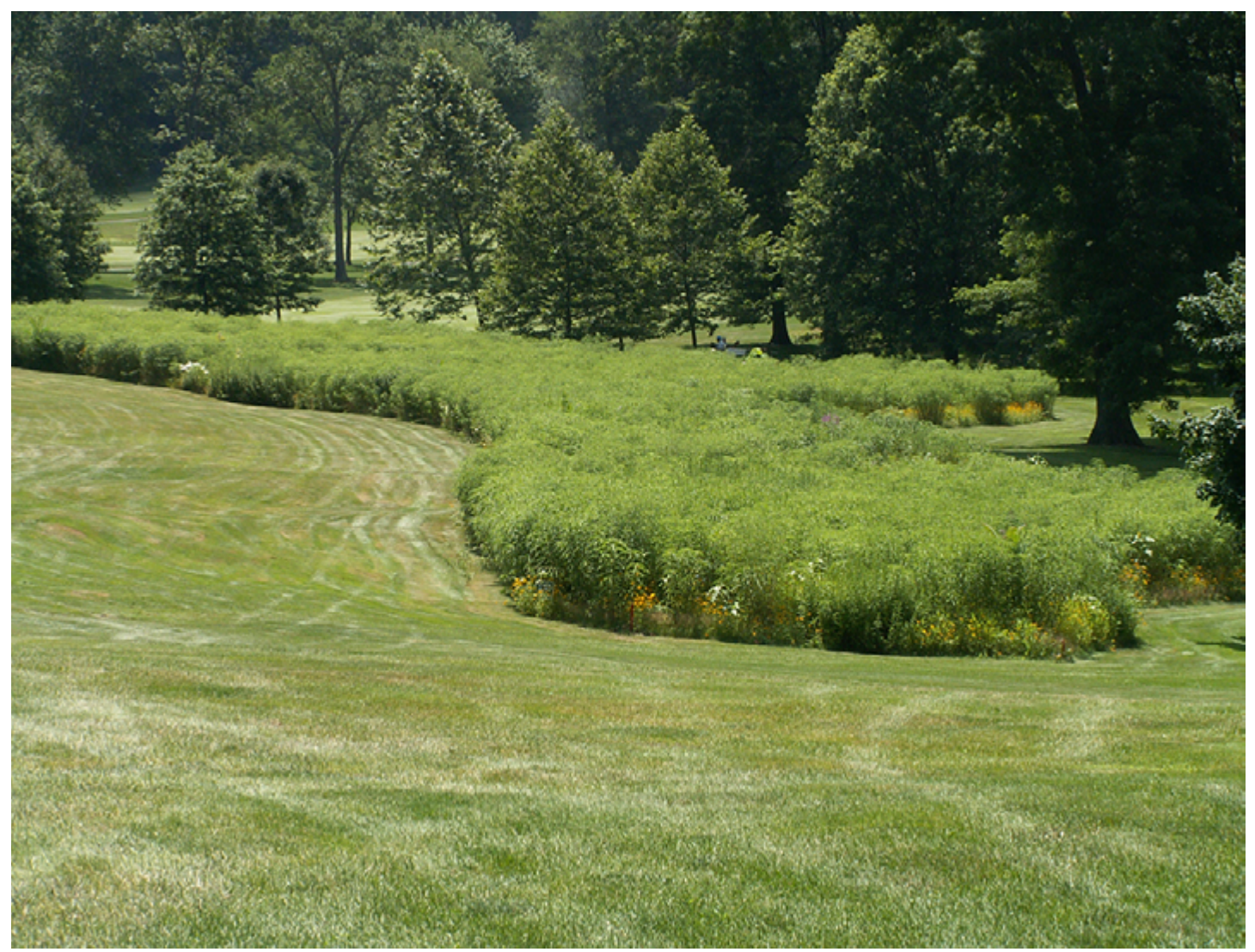
Large out-of-play rough areas can be transformed into wildflower areas.

Blue skies, fresh cut grass, a bird chirping — golf at its finest for many. Being outdoors is part of what makes golf great, and golf courses provide a unique link between golfers and their environment that is shared by few other sports. The course serves as both playing field and home to many forms of wildlife and plants. It is often a key habitat oasis in more urban and suburban settings, and golf course superintendents play an