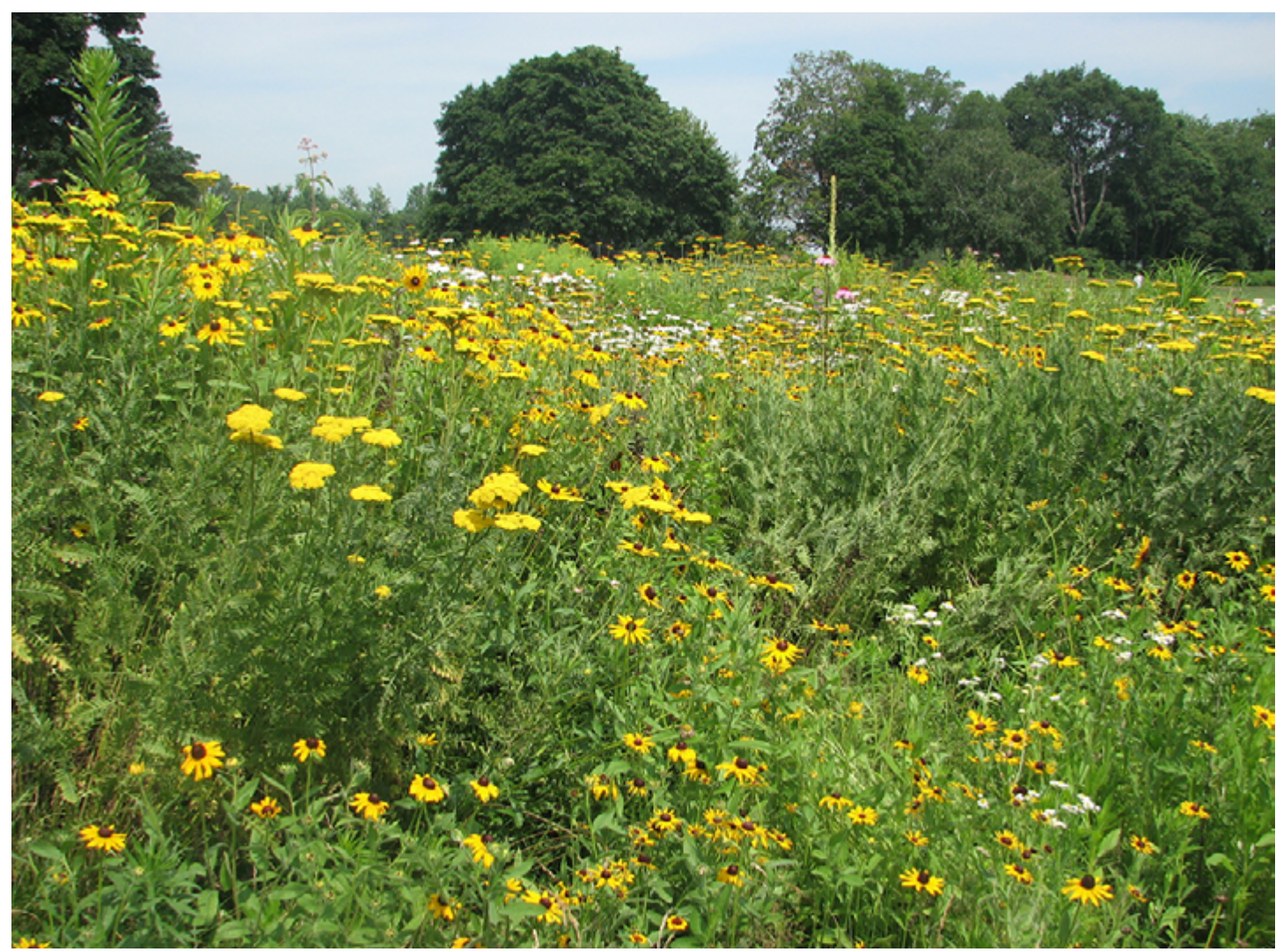
Wildflowers are visually attractive and also provide great environmental benefits for golf course wildlife.

The naturalized wildflower areas at Rockland C.C. are just one of many programs that highlight the environmental benefits golf courses can provide. In addition, encouraging the monarch butterfly population on the