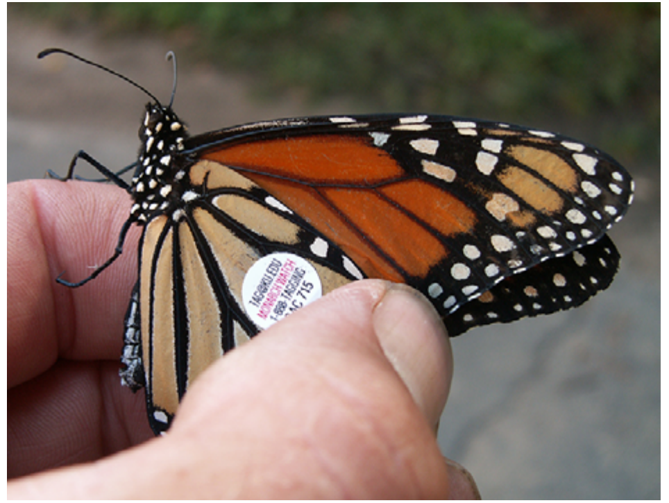
A tagged butterfly can be tracked easily to monitor its migration from Rockland C.C.

golf course became a very popular activity with golfers and employees at Rockland C.C. An interactive display was created in the clubhouse to generate interest in monarch butterflies. The fish tank display houses caterpillars found on the golf course, which can then be monitored by members and employees as they morph into butterflies and moths. Educational materials were provided to further educate members and their children. Once the butterflies appeared, they were tagged with an ID number so they could be tracked as they migrated south. These ID numbers are logged into an online data base (www.monachwatch.org) that allows people to see how far the butterflies migrated.