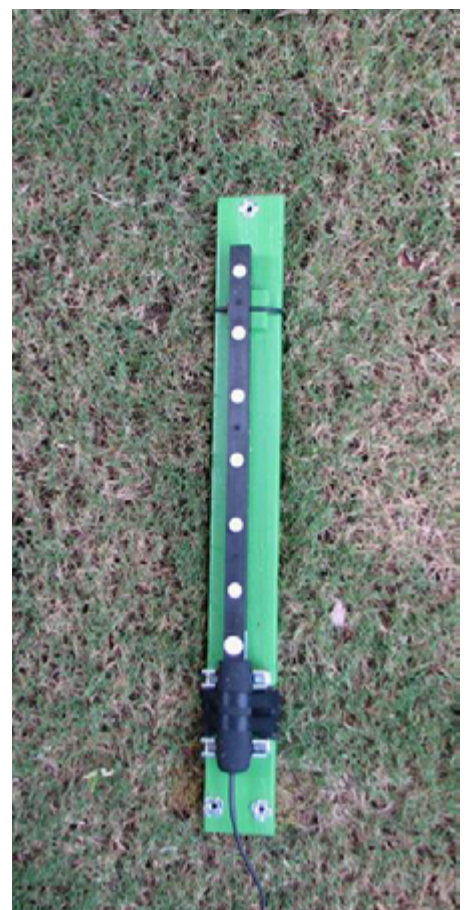
Meters with multiple sensors are now financially affordable and can be used as a tool in assessing the quantity of photosynthetically active radiation (PAR) for turfgrass plants.

deemed unsuitable for an ultradwarf. In this case, removing trees or moving the green is necessary.