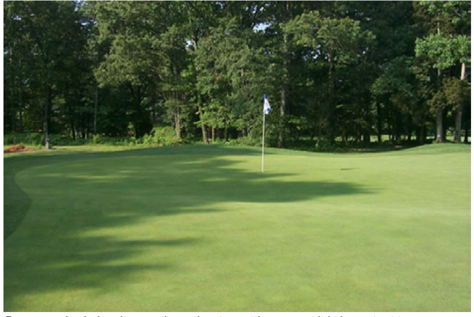
Because shade levels vary throughout a putting green, it is important to measure light levels at different locations on a given putting green.

If someone is interested in determining the percent shade that a putting green receives, it will be necessary to also take a DLI reading on any area in full sun. To determine the percentage of shade, use the following equation.