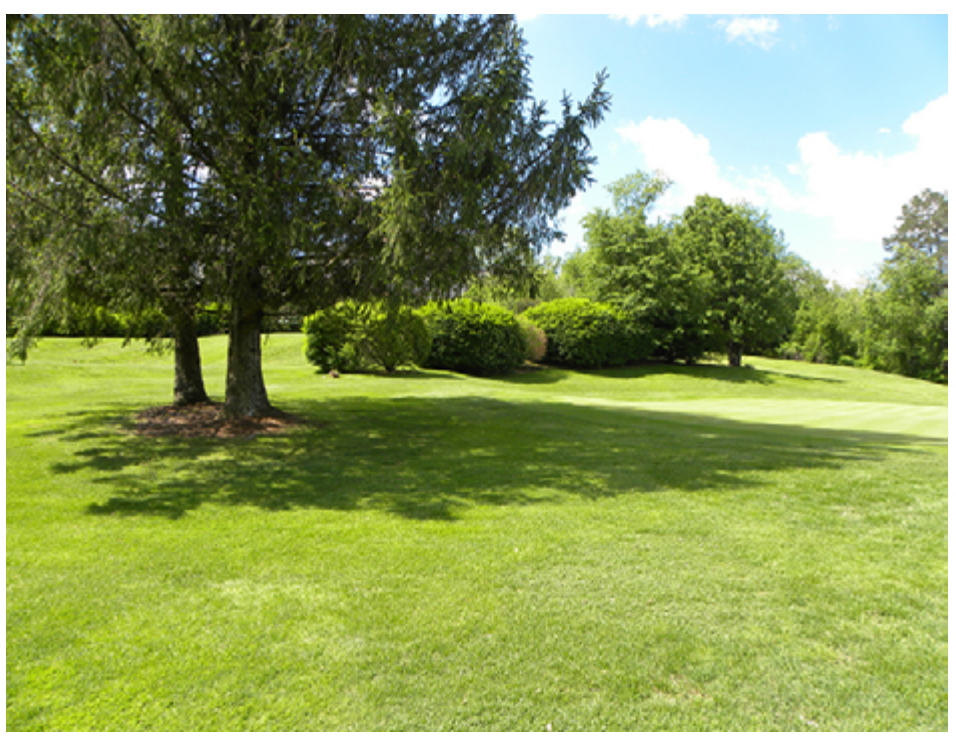
Planting trees too close to a putting green can result, years later, in levels of shade that hinder turfgrass growth, particularly ultradwarf bermudagrasses.

A golf course superintendent can identify the putting greens that historically have battled issues caused by shade. It is common on some greens that there is only a small corner or area that may receive more shade than other parts of the green. It is a good idea to take two or three measurements