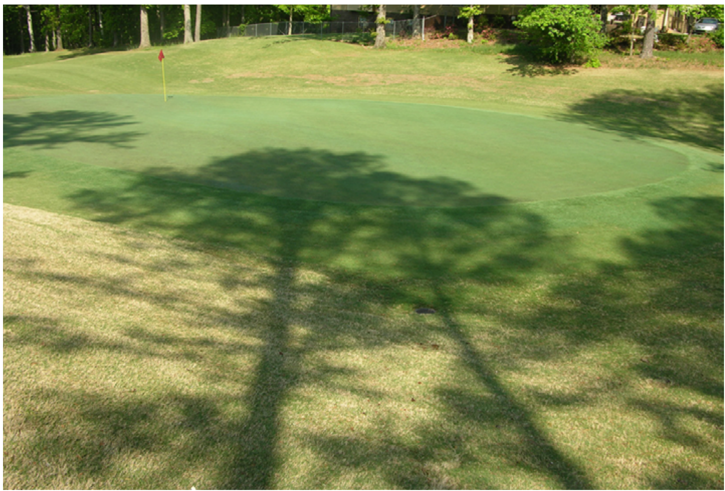
Shade from trees surrounding a putting green vary throughout the year due to the changing angle of the sun. The quantity of light for plant growth not only changes based upon shade, but on the time of day.

under varying levels of shade. They found that plots with four hours of sun (12 noon to 4 pm), applications of Primo, and a 3/16" height of cut, produced acceptable turf quality at a DLI of 22.1. These researchers concluded, "Therefore, applying a plant growth regulator that inhibits gibberellic acid and raising mowing heights will improve the growth, quality, and performance of ultradwarf bermudagrass greens in shade (Bunnell and McCarty, 2004b)."