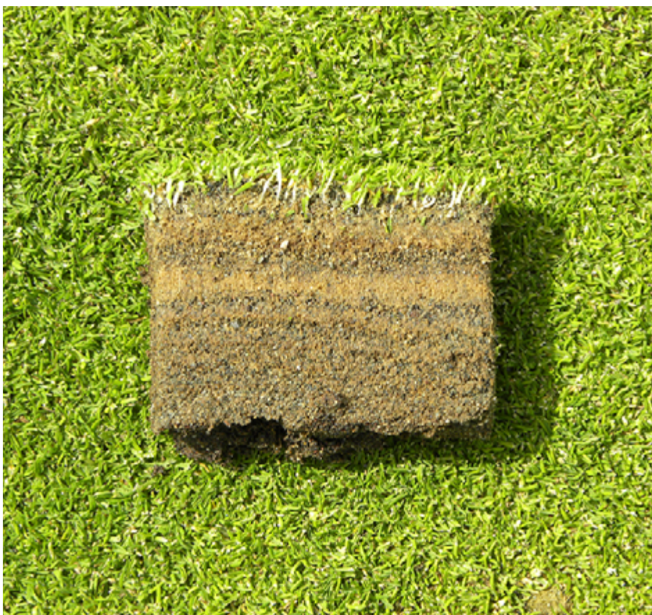
Regular aeration and sand topdressing helps, but without deep vertical mowing and light sand applications between aerations, layers of organic and sand will form.

ness is a requirement. Less water + less nitrogen = less organic matter production. They also understand that green grass requires far more “green” (i.e., cash) to maintain the surfaces. Color is not a requirement for a good playing surface, thus the reliance on nitrogen is far less. Instead, less expensive micro-nutrients, such as iron sulfate and magnesium sulfate, are used to create some color on their golf courses without excess organic production near the surface. Less organic + less water = firmer and faster playing surfaces. (Note: The lack of power cart usage in the U.K. is another factor that lessens nitrogen requirements.)