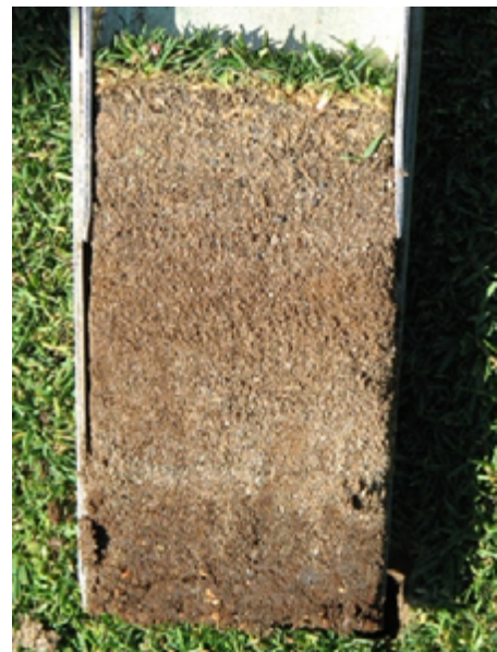
Consistent aeration/topdressing, light sand topdressing, and vertical mowing can greatly reduce the negatives associated with too much organic material.

The USGA TruFirm is used for our national championships to monitor firmness that is appropriate for the high skill level of the players in each championship. On regular USGA Turf Advisory Service visits, it is used to compare greens and approaches to help players and the maintenance staff understand the differences and the impact of organic material production on playing conditions.