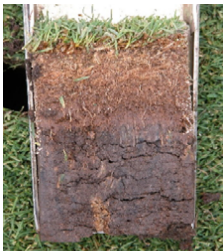
No aeration, no sand topdressing, and no deep vertical mowing — the results will produce soft approaches with no ball release.

In reality, the above program will help firm the approaches, however it will result in layers of sand and organic matter that develop in the time between aeration treatments. To eliminate this problem, many have simply expanded their light sand topdressing program for the greens to the approaches, with some including an additional pass with the topdressing machine on this higher mowed area. Regardless of how much sand is applied (remember, the more the better), this will help offset excess organic material production.