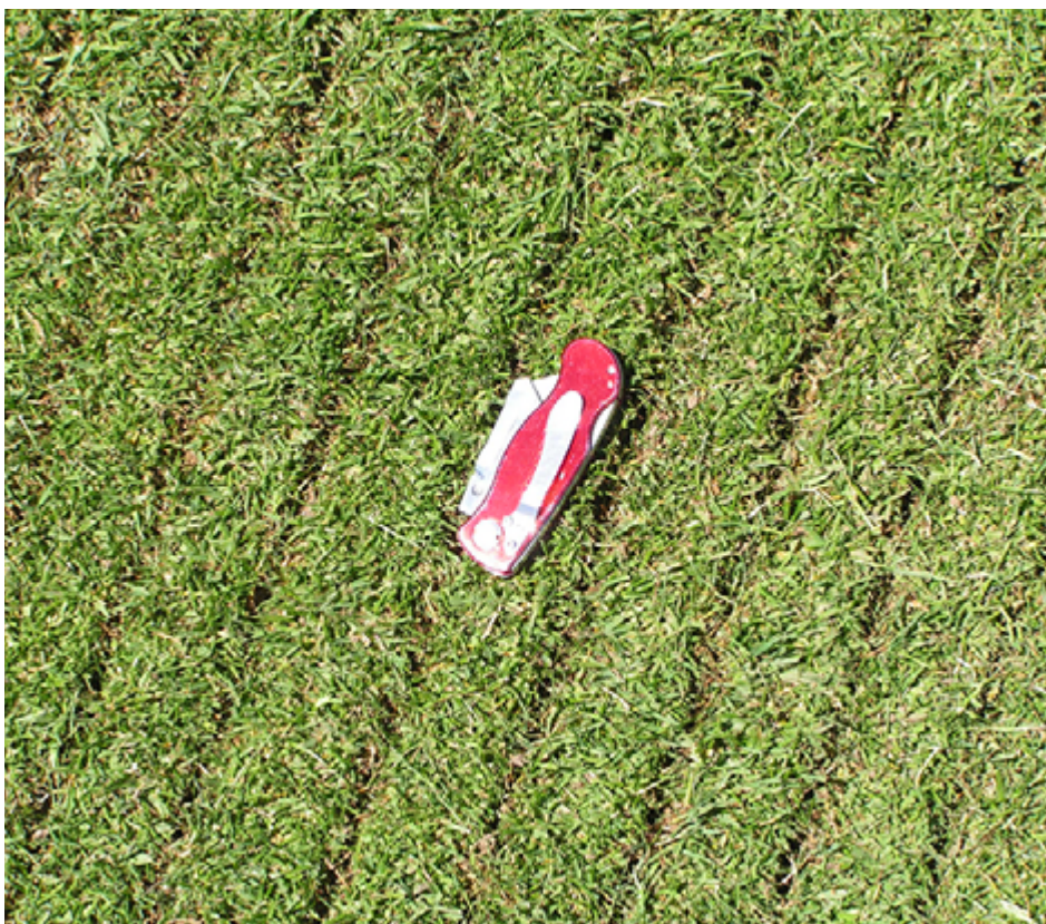
Deep vertical mowing will remove far more organic material than aeration.