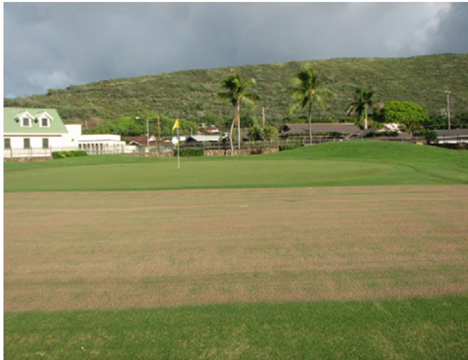
Aeration and sanding can go a long way to firming green approaches, but more management is needed to address organic production.

While putting green construction became largely sand based starting in the 1960s, the approaches were not built in a similar manner. To this day, with the exception of those golf courses built on sand or with a sand cap, the 10- to 15-yard area in front of greens often has insufficient drainage and is typically maintained the same as the