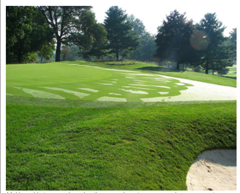
Making wide turns and varying the area where turns are made can prevent wear patterns from developing on collars.

Sand Abrasion. The worst collar damage often occurs because of sand abrasion from bunker splash, topdressing overlap, or sand accumulation during core aeration. Often, sand abrasion acts as a "double whammy" and adds to collar stress where space to turn equipment is already limited. Sand blasted from bunkers can settle into collars creating an abrasive environment that effectively emulates sandpaper on grass as traffic traverses the affected area. Sand topdressing applied to a green that overlaps into the collar or sand that is deposited on a collar during the aeration process can also cause problems, especially