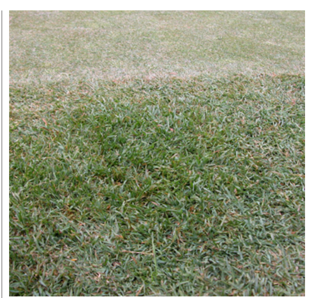
Excessive lateral growth of creeping bentgrass makes it more susceptible to mechanical damage and sand abrasion. Grooming, brushing, and reducing mowing heights are all strategies that can reduce lateral growth and promote density.

Select the Best Mowing Height. Height of cut and growth habit have a major impact on the ability of creeping bentgrass collars to withstand mechanical stress. While it may seem counterintuitive, reducing the height of cut generally improves wear tolerance on collars. Collars are commonly mowed at 0.250 to 0.300 inch to encourage upright growth and increased plant density.