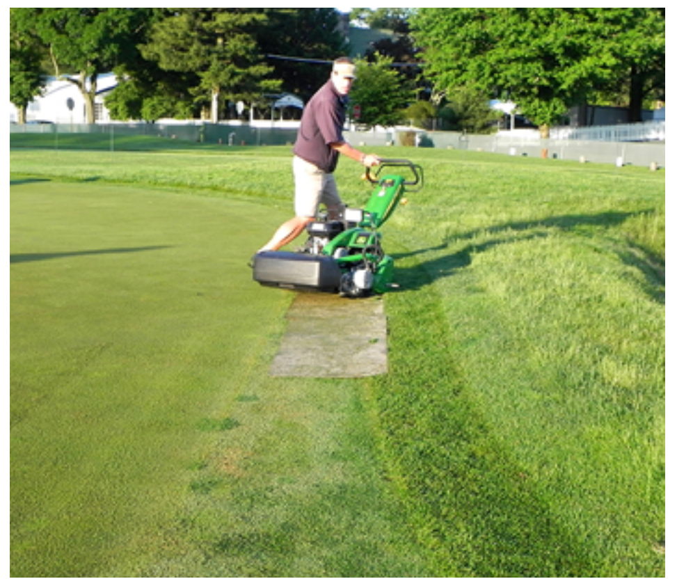
Plastic mats can be used to protect collars from traffic. Despite increasing time for putting green preparation, the popularity of these mats is increasing.