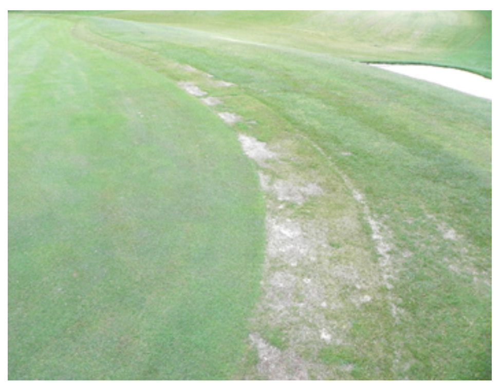
Traffic from rollers and mowers needed to prepare actively growing creeping bentgrass greens can lead to decline of warm-season collars at times of the year when these grasses are dormant or growing slowly.

Keep in mind that the factors discussed below are often found in combination with each other. Awareness of the following factors allows preventative strategies to be developed.