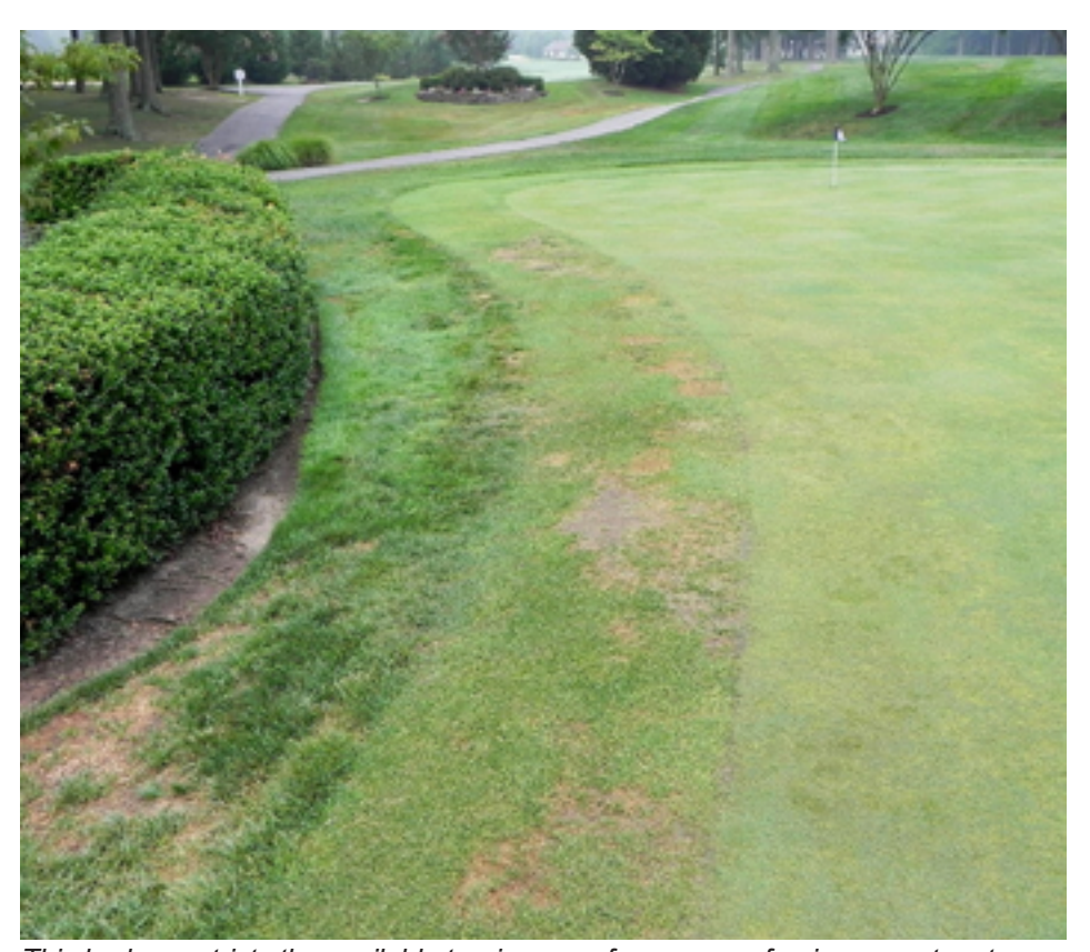
This hedge restricts the available turning area for mowers, forcing operators to turn on the collar, which has declined due to mechanical stress caused by concentrated traffic.

©2014 by United States Golf Association. All rights reserved. Please see Policies for the Reuse of USGA Green Section Publications. Subscribe to the USGA Green Section Record.