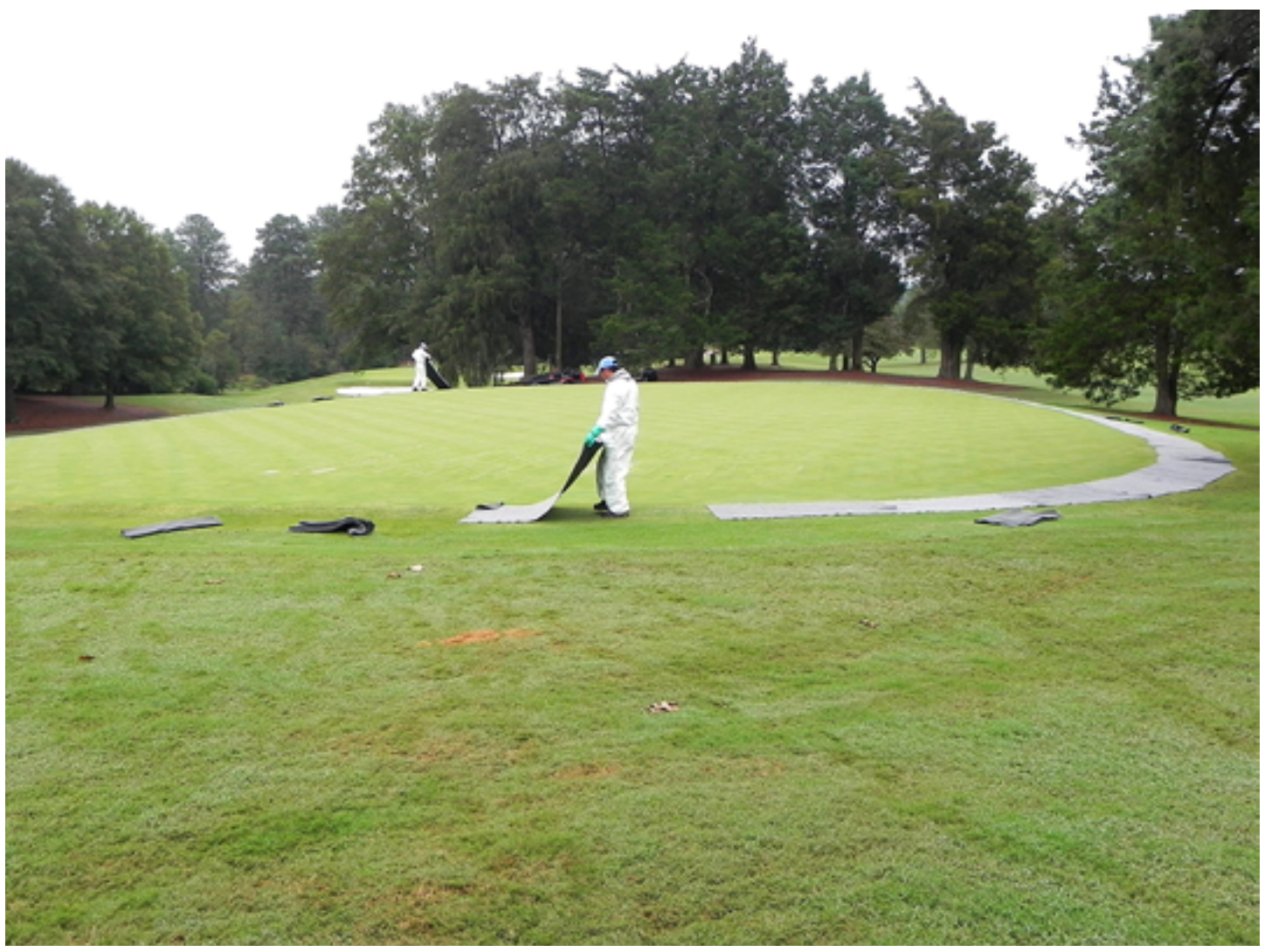
Carpets can be used to protect warm-season collars during growth regulator applications, but this strategy is labor intensive and increases the time required for applications.

utting green collar (or apron) management has been challenging for many golf courses in recent years. Most golfers do not realize the constant abuse imposed on the narrow strip of turf that separates the putting green from its surrounds. This abuse can lead to turfgrass decline that is unsightly and detrimental to playability.