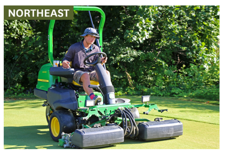
Making Big Things Happen With Small Numbers

Many courses have fewer staff after high school and college students return to class. With plenty of golf season left, management adjustments will ensure a successful fall season