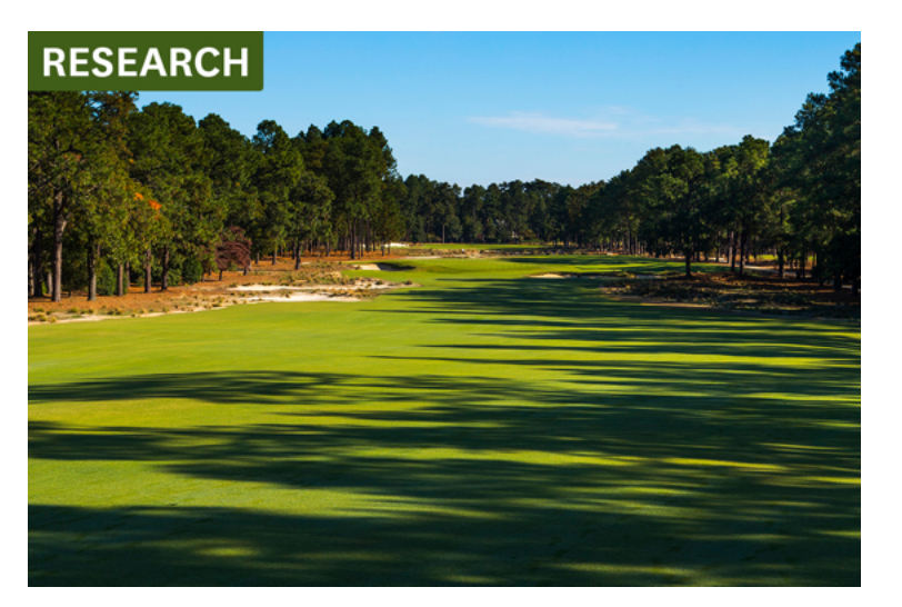
How Much Light is Enough? Daily Light Integral Requirements for Warm-Season Grasses

Knowing how much light grasses need is essential for successful management. This research offers insight into turf selection and strategies for identifying and managing shade issues.