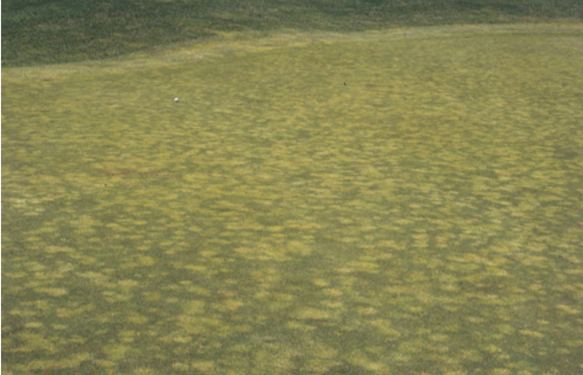
Annual bluegrass first colonizes a putting green as individual plants that can be nearly invisible. The plants expand into small patches that can become very obvious and unattractive, and they can disrupt surface smoothness.

mer months. The vast majority of greens in the Northeast Region are two-grass systems.