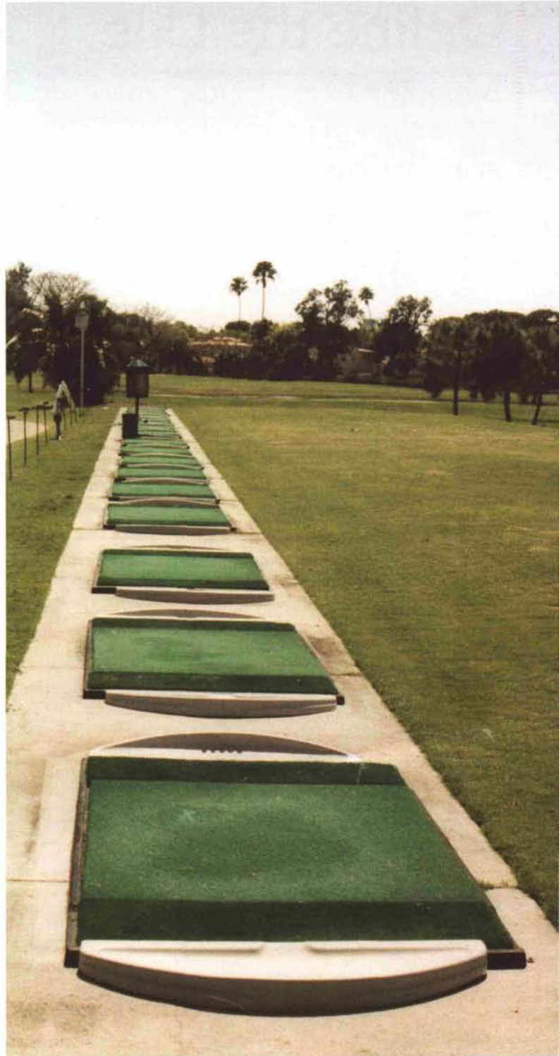
The shape of this mat allows it to be rotated to help spread wear over the surface.