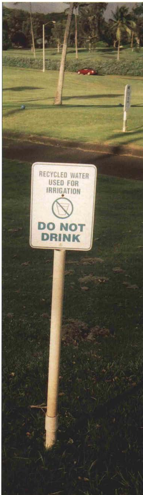
Use of alternative irrigation water sources is just one example of infrastructure improvements that may already be implemented on the golf course prior to an EMS assessment.

• Environmental Institute for Golf (EIFG) ( http://www.eifg.org/ ). The