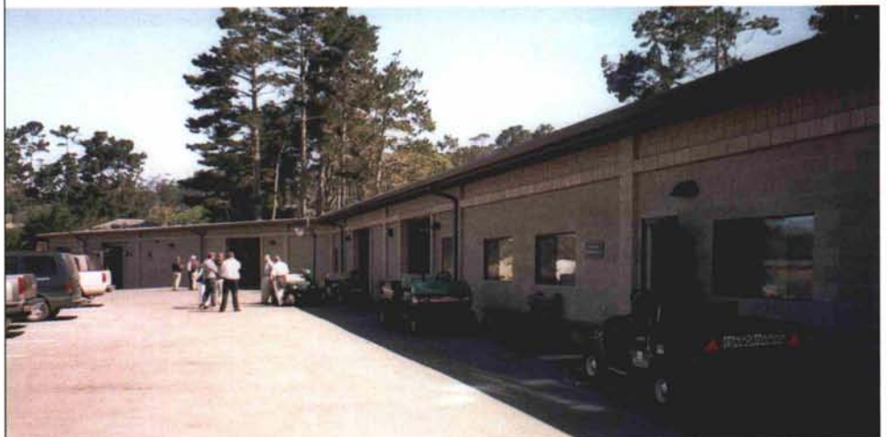
Golf course maintenance facilities should be sustainable both in their design and operation.

Outreach (Element 9 of Figure 1). The USEPA EMS consists of 17 elements, but we have broken out “communications and outreach” into two elements (USEPA 2007). In addition to internal communication directed toward EMS improvement, golf courses should strongly consider becoming an aggressive outreach and education resource for the community . The community is interested in the environment and may not be very well informed on the environmental sustainability and stewardship activities of a golf course. An EMS provides an excellent vehicle to use in community outreach and education. Audubon International (2007, 2002) has several fact sheets and other information related to this topic. Outreach and education activities will require a plan and commitment, such as: