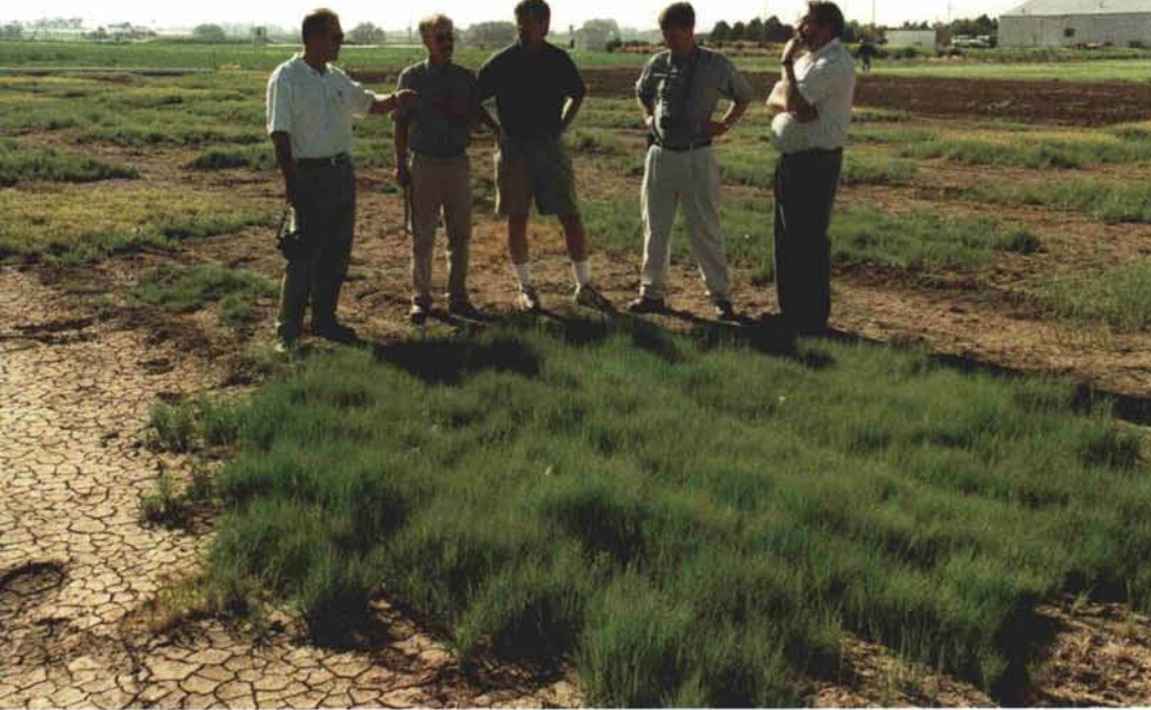
Development of new low-water-use grasses for golf courses is an important continuing effort. The USGA Turfgrass Environmental Research Program is funding research at Colorado State University in the development of saltgrass ( Distichlis spicata ), a turfgrass species with exceptional salinity tolerance and growth potential in hot environmental conditions.

may be obtained and then integrated into a future plan. That is the nature of EMS and BMP — not all the answers to questions need to be obtained before an initial plan is developed. EMS is cyclic in nature and is intended to continue the processes of planning/implementation/monitoring/review and continue the cycle again.