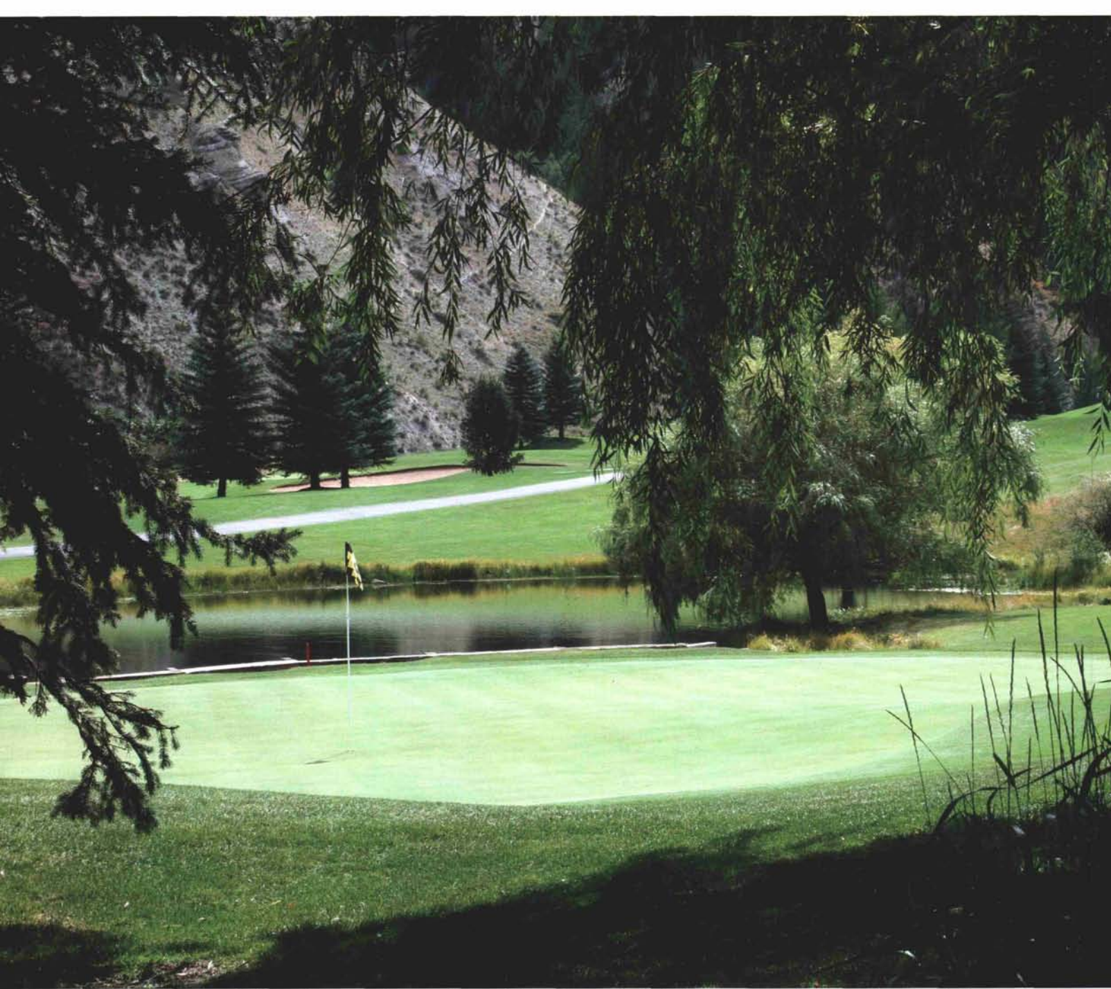
Active participation in the Audubon Cooperative Sanctuary Program helps golf courses highlight their environmental efforts and promote the fact that they are doing right by the environment (Beaver Creek Golf Club, Avon, Colo., fully certified in 2003).