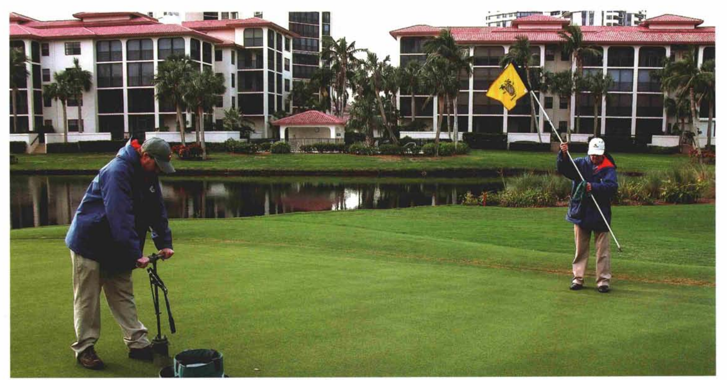
J.T. (right) assists with golf course service activities each weekday morning.