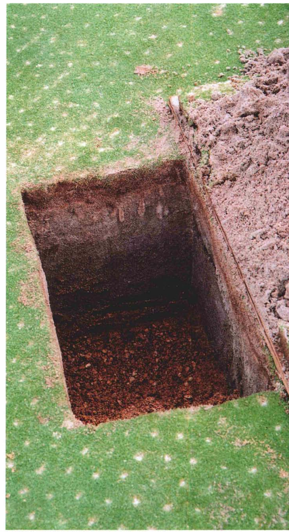
Careful observation and testing are needed to determine whether a green must be rebuilt or only resurfaced.

Research has shown that greens built to the USGA method maintain their original integrity below about the 4-inch depth many years after construction. It is the upper 3- to 4-inch zone that undergoes a drastic change in composition in the field with age. An increase in silt and clay from topdressing, wind movement, or sometimes through dissolved solids in irrigation water, creates this change in the upper zone. Organic matter (OM) buildup, however, is the primary effect that leads to poor infiltration, a tendency for black layer, increased algae on the surface,