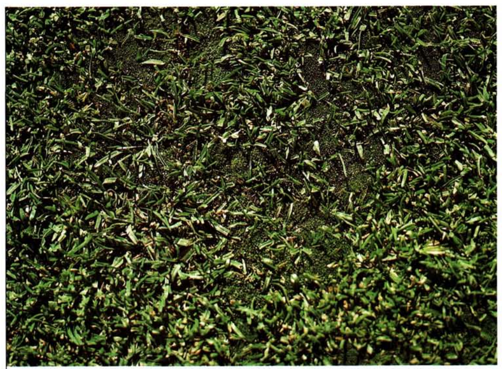
Moss can encroach into a putting green virtually unnoticed until one day it appears to be taking over the surface.

Junction is a turf and ornamentals fungicide (sold by Griffin L.L.C., Valdosta, Georgia) formulated as a dry flowable containing 15% mancozeb and 46% copper hydroxide as the active ingredients. Junction currently has a FIFRA Section 2(ee) recommendation for moss control in greens, tees, and