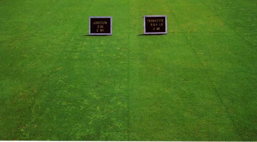
Junction (plot on left) was ineffective in controlling moss during summer trials, but TerraCyte (plot on right) provided good control. TerraCyte should only be used for spot treatment of moss (applied directly to moss patches and not to turf) during summer when temperatures and humidity levels are high. Broadcast applications can be made during periods of cool temperatures and low humidity.

infestation of silvery thread moss (average of 40% surface area infested with moss). Thus, it was an ideal site for conducting moss control studies.