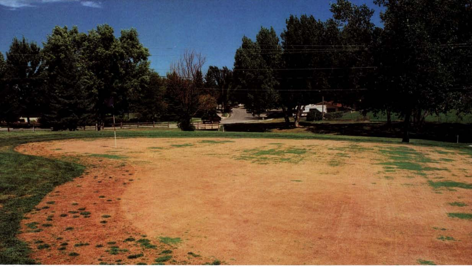
An older stand of putting green turf dominated by annual bluegrass will be susceptible to physiological collapse when excessively close mowing and intensive grooming practices for green speed are coupled with stressful heat and humidity. Newer creeping bentgrass cultivars have been developed with improved heat stress, density, and tolerance of close mowing — all of which improve reliability.

across North America. Whether you agree with this trend or not, there is little doubt that new cultivars of creeping bentgrass and bermudagrass improve the odds of success when ultra-fast greens are desired. This is especially true in humid climates where disease pressure and physiological demands are high.