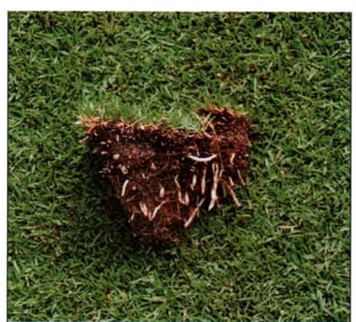
Vigorous rhizome growth is one trait of seashore paspalum that allows it to compete effectively against bermudagrass and weeds. In addition to exceptional salt tolerance, this grass tolerates a range of mowing heights and can withstand concentrated traffic, all with low fertility requirements.

The development of Kentucky bluegrass cultivars capable of tolerating