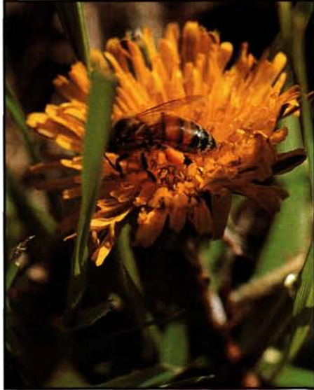
Preventive grub insecticides should pose little or no residual hazard to pollinators so long as residues are watered into the soil. See page 8.

Cover Photo: To provide the conditions that golfers expect today, turfgrass managers need more sophisticated equipment than ever before (Pinehurst No. 2, North Carolina).