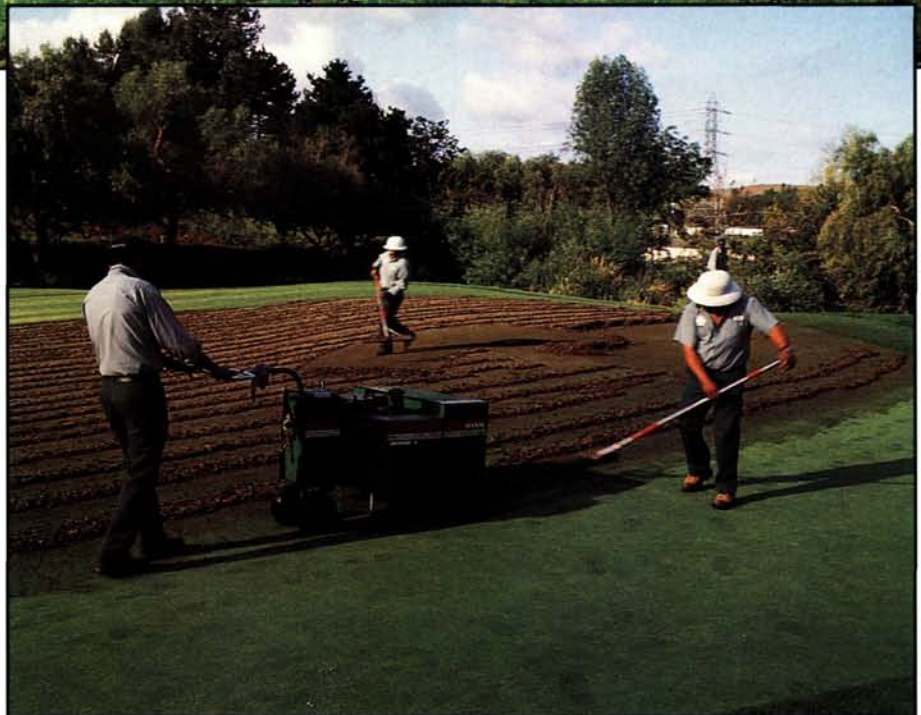
Core aeration is often perceived as the “dirty job” of golf course maintenance, but it serves a critical purpose for the long-term health of the turf.

An important purpose of core aeration is the physical removal of un-