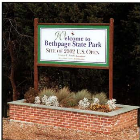
In June 2002, Bethpage State Park (New York) will be the first government-operated golf course to host the U.S. Open Championship. See page 1.