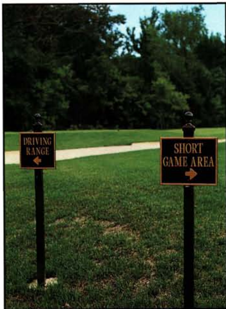
As practice becomes more a part of the golf landscape, elaborate practice facilities have become more prevalent. See page 1.

Cover Photo: The desire of golfers to practice is changing the way that practice facilities are integrated into the golf course landscape.