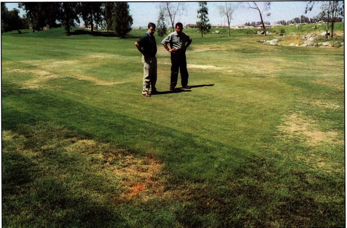
This patch of seashore paspalum is surviving better than the surrounding bermudagrass in this poorly drained, high-salt-content soil.

4. Check S and/or sulfate levels in the water. If S > 60 ppm or \text{SO}_4 > 180 ppm, you may need to use lime as an