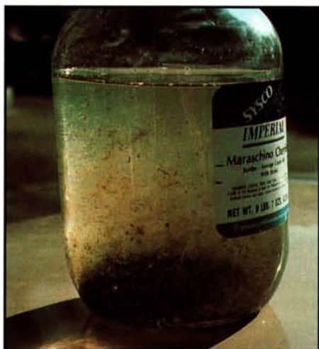
Excess suspended solids can plug water-conducting pores at the soil surface. Low-quality effluent irrigation sources are notorious for containing high loads of suspended organic solids.