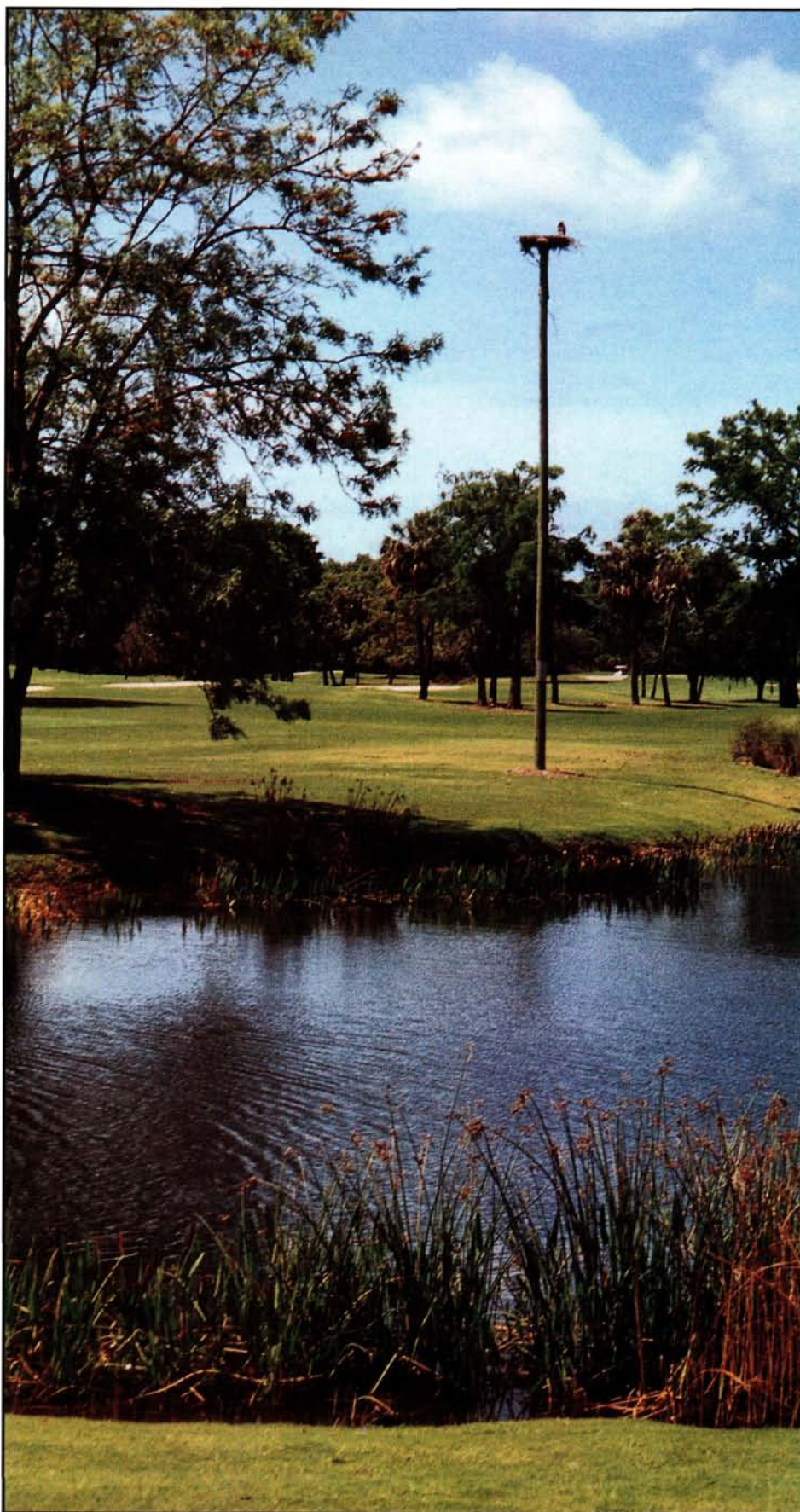
Lakeside planting and an osprey platform enhance wildlife diversity and aesthetics at the Hole-in-the-Wall Golf Club, Naples, Florida.

Our exotic plant removal program began a number of years ago and has won general acceptance by the mem-