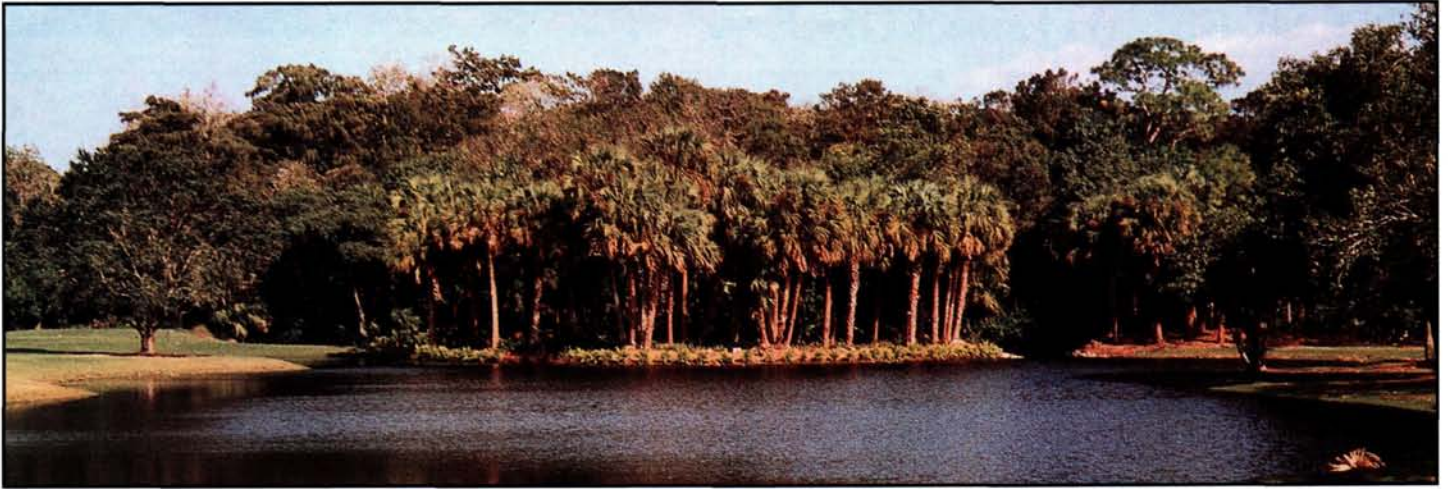
A concerted effort was made to remove exotic, invasive plant species during a scheduled golf course renovation period. The end result enhanced the beauty of the golf course natural areas.