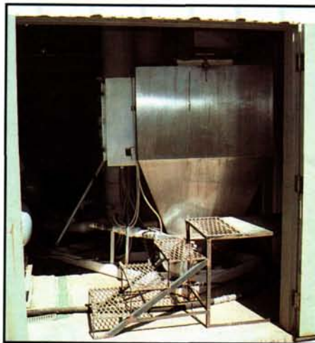
Acid injection and sulfur burners can be used to treat water with excess bicarbonate levels. Acidifying irrigation water to a pH of 6.5 reduces bicarbonates by approximately 50%.

Another set of water data factors is also important in influencing Na + activity — namely, relative levels of bicarbonates (HCO 3 - ) and carbonates (CO 3 -2 ) in relation to Ca +2 and Mg +2 concentrations (Tables 3 and 4). When high HCO 3 - and CO 3 -2 levels (> 120 and 15 ppm, respectively) are applied through the irrigation water, these ions