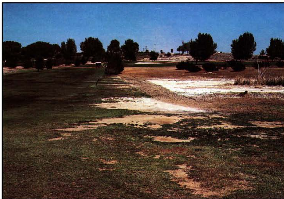
Continuous use of saline water sources without leaching the soils can lead to serious salt accumulations and ultimately turfgrass decline.

High total salts or total salinity concentrations will often reflect the potential for a saline soil problem to develop. Saline conditions inhibit water uptake by turfgrasses and cause a salt-induced drought stress. This is the most common salt-related water issue that occurs and must be managed on golf courses. Total salinity problems are site-specific and must be assessed on that basis, and management strategies