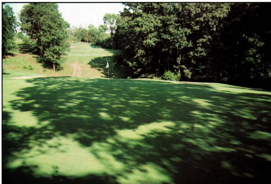
The products of a poor grass-growing environment include thin, weak turf, moss, algae, and increased pesticide usage.