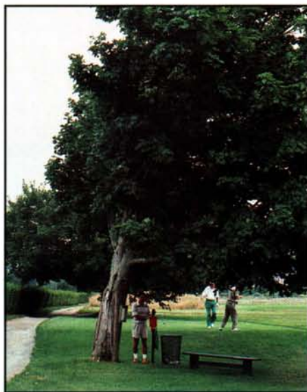
A tree simply cannot be valued above a human life. Unsafe trees in heavy traffic areas need to be addressed quickly and should be removed.