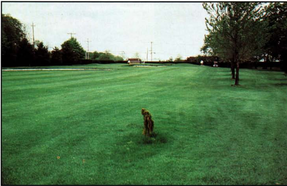
It takes some imagination to envision that the cute little shrub in a one-gallon container will eventually grow into a golf ball-swallowing monster!