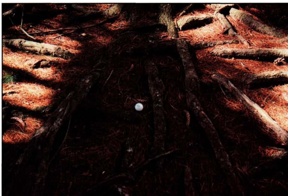
Trees with invasive root systems, both above and below the surface, wreak havoc with the turfgrass, golfers, and maintenance equipment.

Trees take a long time to grow, and there is nothing wrong with having to come back and revisit some of the more complicated situations.