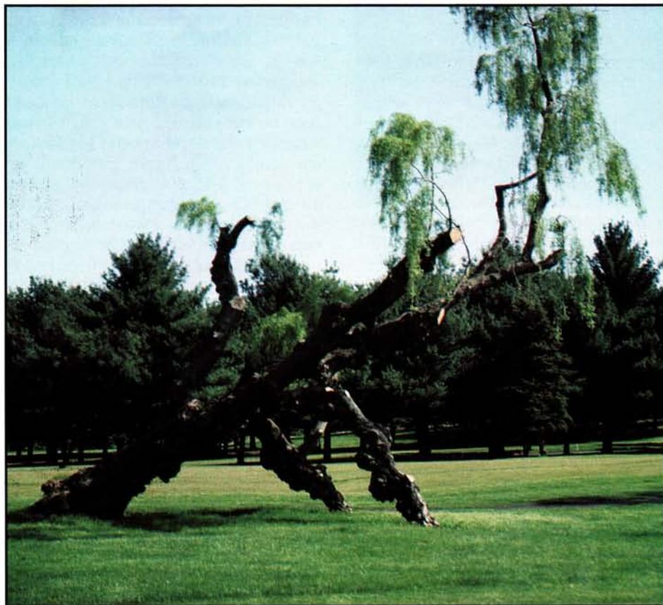
Some trees, due to structural weaknesses, are not good choices. If the trees provide strategic value to the golf course, they should be replaced with a better species.

The impact on aesthetics and surrounding trees: Although it is well understood that trees compete with turf, one must remember that trees also