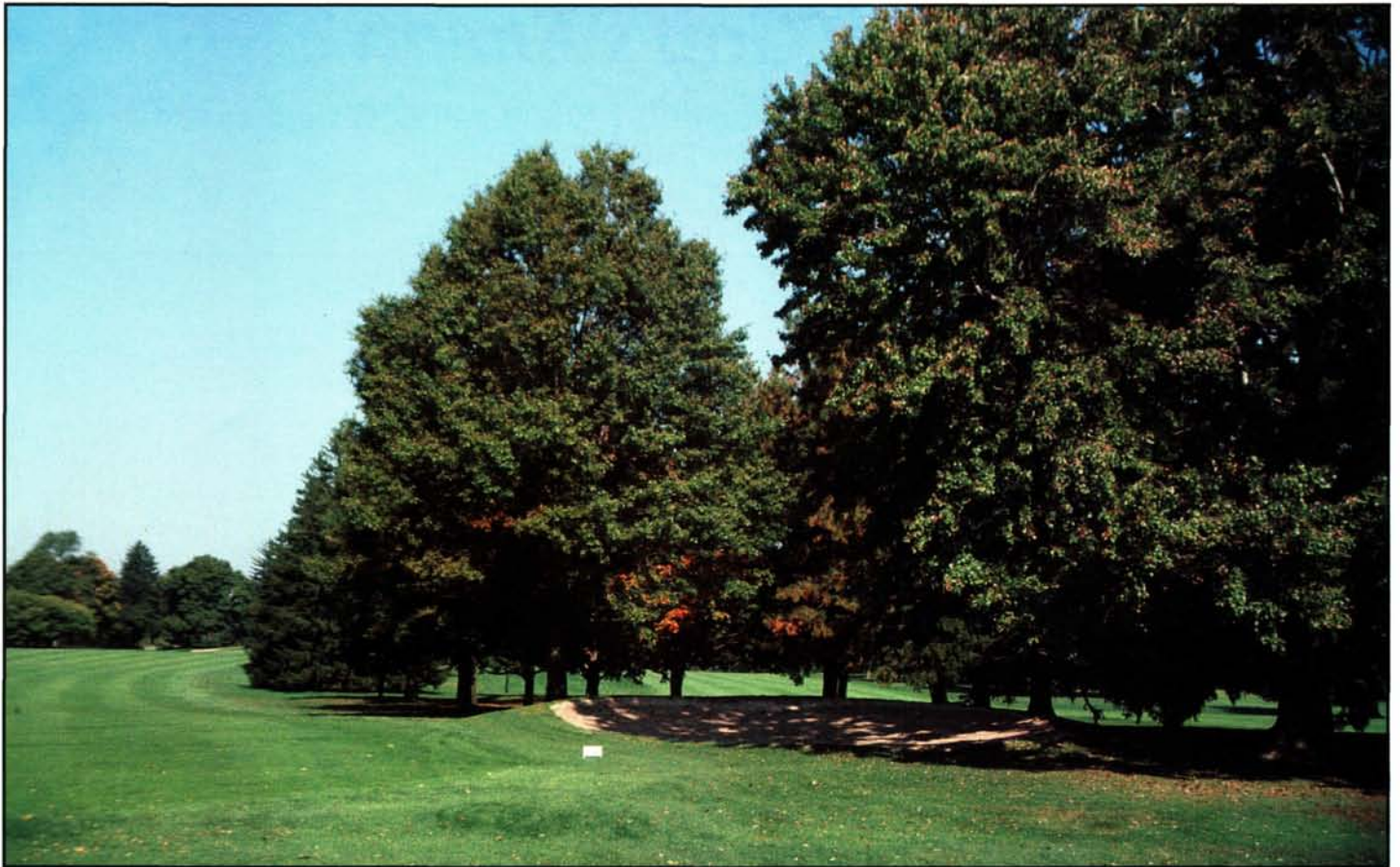
Trees that block advancement from a hazard are sometimes referred to as double hazards. The solution in this situation is straightforward — remove or relocate the bunkers or remove the trees.

can leave us feeling that we have made a lasting and beneficial mark on the earth. Since many of our home lawns are small, there often is limited space available to plant trees. For golfers, it is only natural that their tree planting efforts frequently are transferred to the biggest landscape they know, the golf course.