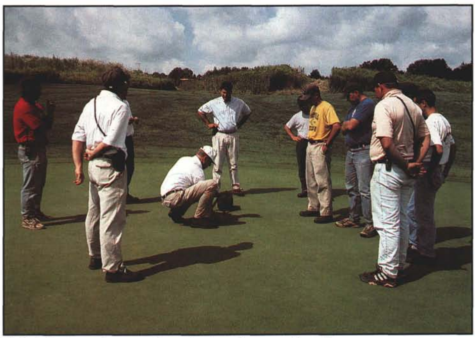
Turf students can be some of your best employees on the golf course. They not only have the opportunity to learn from the golf course superintendent and their interaction with one another, but also they learn from Turf Advisory Service visits.

Not only do the turf students learn from participating in the program, they also learn from each other. We have found that it is beneficial to attract students from the many different turf management programs throughout the world. Each student brings a different perspective to the table and is able to share common practices from their region. Your current students directly impact the future of your program just