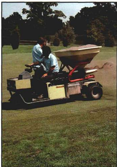
A light topdressing program smooths and firms the putting surface. The last topdressing before a tournament should be scheduled 11 to 12 days prior to the event. See page 1.

Cover Photo: This aerial view of DuPont Country Club (Delaware) demonstrates the importance of attention to detail, good turfgrass, and good preparation.