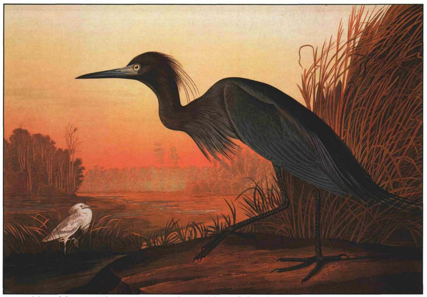
A copy of the Audubon print "Blue Heron" is presented to each fully certified member.