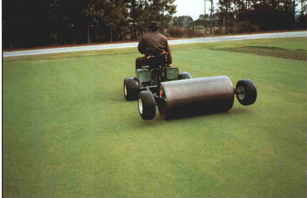
Historically, golf course superintendents used rolling as a mowing supplement in turfgrass management programs.

Aerification is a practice that's essential for high-quality putting greens, but unfortunately golfers have a poor