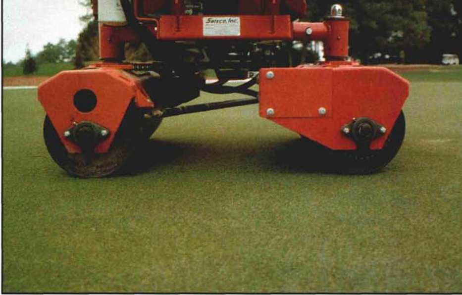
Compaction potential of various roller units can be compared by calculating the roll factor, which includes the unit weight, length of the rollers, and the diameter of the rollers in the equation.

putting green, there is some amount of depression into the putting surface, which changes the area of contact. To complicate matters, the area of contact is not linear but circular, and the weight of the unit is not distributed equally at all surface points. The amount of depression into a green can vary with thatch levels, mowing height, soil moisture, rootzone construction, and other factors. As a result, PSI can be extremely variable and difficult to determine. In determining PSI, it is unlikely that each manufacturer has used the same assumptions, leaving the superintendent to try and compare apples to oranges.