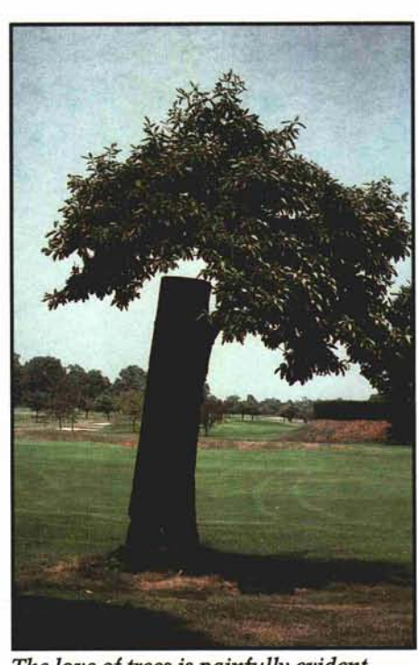
The love of trees is painfully evident with some specimens that people have a hard time giving up.