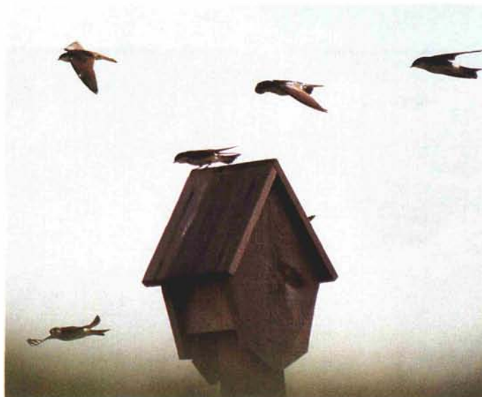
Environmental efforts can result in many satisfied participants.

If you want to gain recognition and support for your environmental programs, you need to increase golfer understanding of wildlife and environmental quality on your golf course. Let the public know that golf courses can be valuable community assets. You can do this by setting up a Resource Advisory Committee that includes your own members, members of the community with special interests (gardeners, birdwatchers), local university or college faculty, or students. They can help you develop an environmental plan of action. You can publicize your efforts through newsletter articles and press releases, or by involving your members in helping you keep a wildlife inventory, inviting scout troops or school children to build nest boxes and monitor them. The idea is to develop visibility for what you're doing