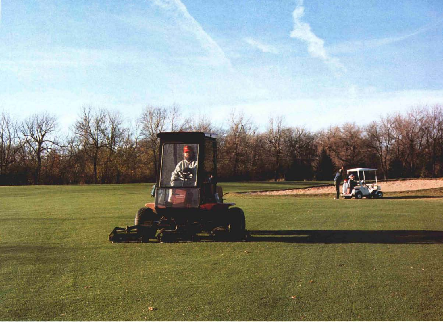
When golfers and crew share the same turf, the maintenance equipment can be modified to provide protection from errant shots.