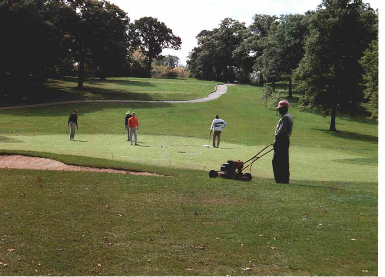
As the popularity of golf increases, the unavoidable distraction of maintenance activities will become a more frequent occurrence. Cog Hill Golf Course, Lemont, Illinois.

Only a few private clubs still enjoy the luxury of being closed all day on Monday, although many are closed to member play or outings at least until noon. Most private clubs hold back play, at least on weekdays, to provide ample time for the crew to stay well ahead of the golfers. Where golfers and equipment occasionally meet, the employee typically is instructed to create as little distraction as possible — get out of sight and turn the engine off until the members play through. This policy is impossible on the majority of daily-fee public courses, except perhaps at the most elite resorts.