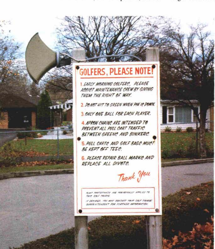
A well-placed sign informs golfers that the crew has the "right of way" when the flagstick is out of the hole. Bonnie Brook Golf Course, Menomonee Falls, Wisconsin.

The use of highly visible shirts can be another effective, but more passive, form of