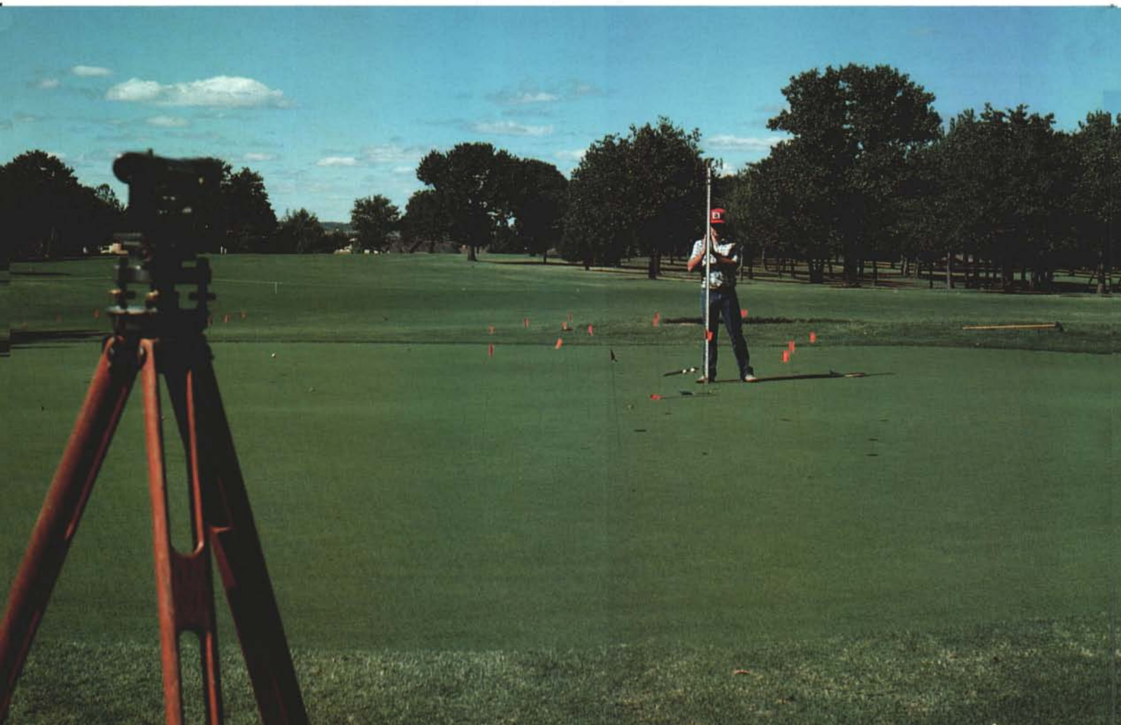
Figure 1. A formula (see text) was derived that corrects for slope in green speed readings. Here, the actual angles of inclination are checked before validation of the formula on the Stillwater (Oklahoma) Country Club.

Getting permission to set foot on these courses was not always easy. Some superintendents were surprised to see two tired, tee-shirted students who wanted to check the speed of their