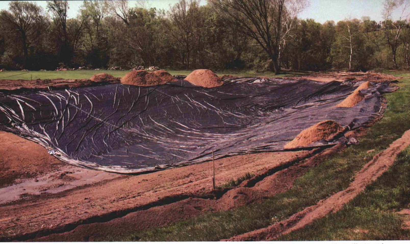
A flexible membrane can provide an effective seal.