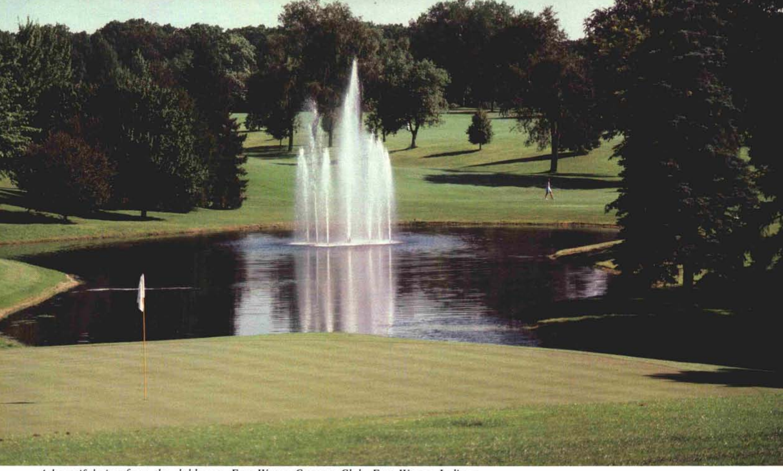
A beautiful view from the clubhouse, Fort Wayne Country Club, Fort Wayne, Indiana.