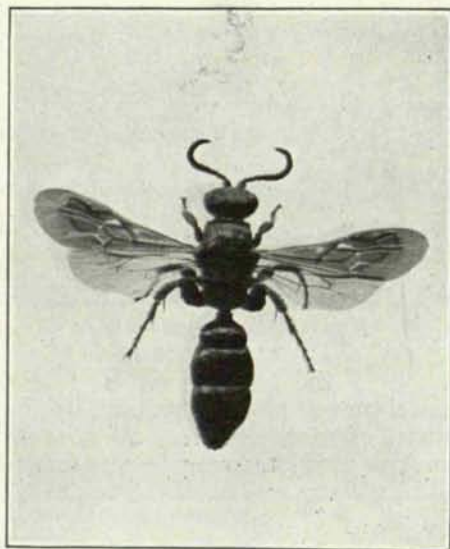
Fig. 3. Tiphia wasp parasite of Japanese beetle grub.

This parasite was found in North Japan and in certain localities it was responsible for the destruction of over 50 percent of the Japanese beetles. This fly is now established in New Jersey where