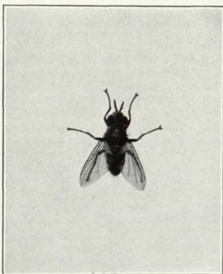
Fig. 1. Centeter parasite of the Japanese beetle.

Later in 1922 an investigation was carried on in Korea. It was found there that the true Japanese beetle was wanting, but that a number of very closely allied forms were to be found. Further study revealed the fact that the natural enemies or parasites of these allied beetles could be easily transferred to the true Japanese beetle. This possibility increased the scope of the work and the ultimate possibilities of control in the United States.