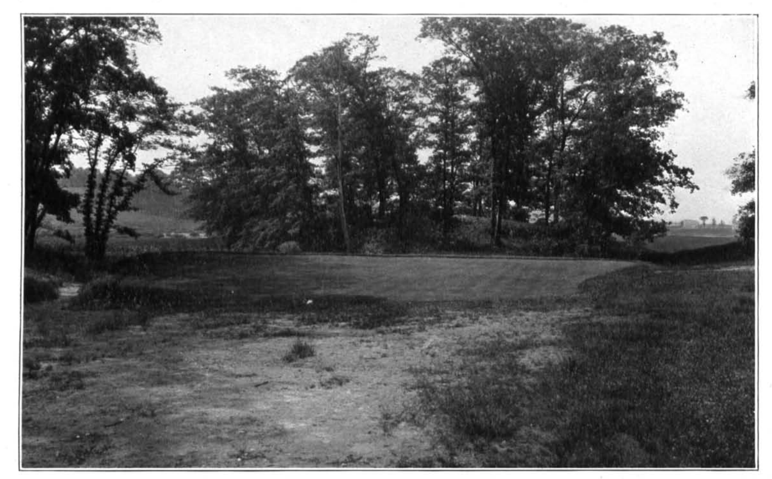
Hole No. 7, Metacomet Golf Club. Close-up view of putting green.