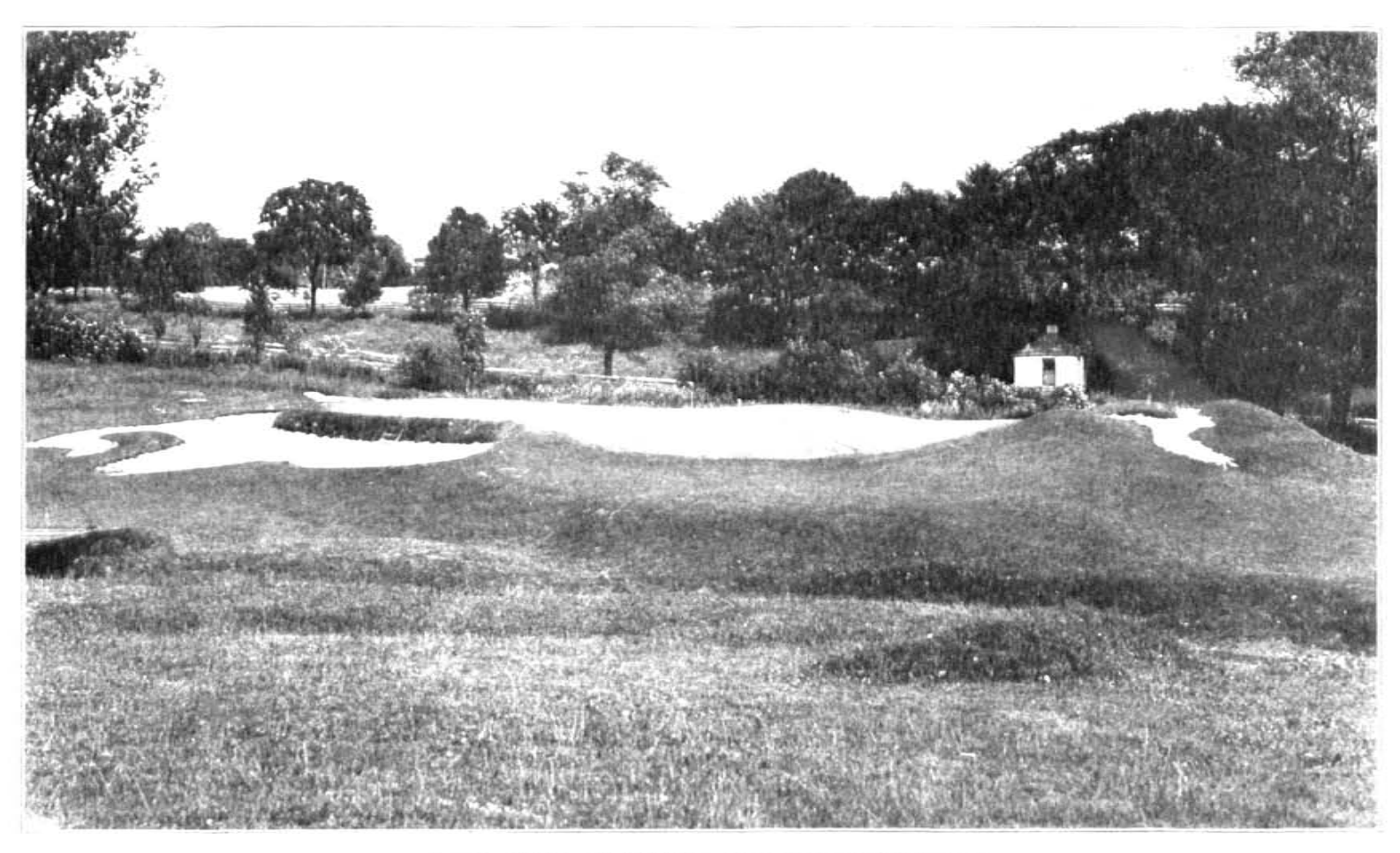
Hole No. 17, Merion Cricket Club. Close up View of Patting Green.