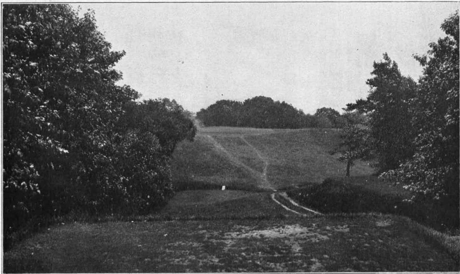
Hole No. 2, Agawam Hunt Club. View from tee.