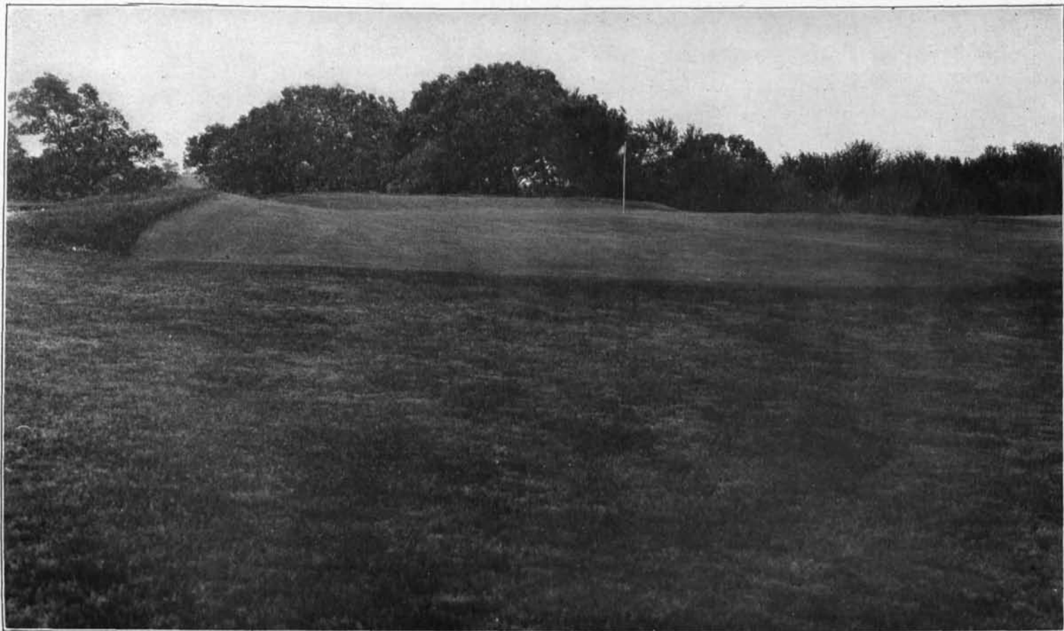
Hole No. 2, Agawam Hunt Club. Close-up view of putting green.