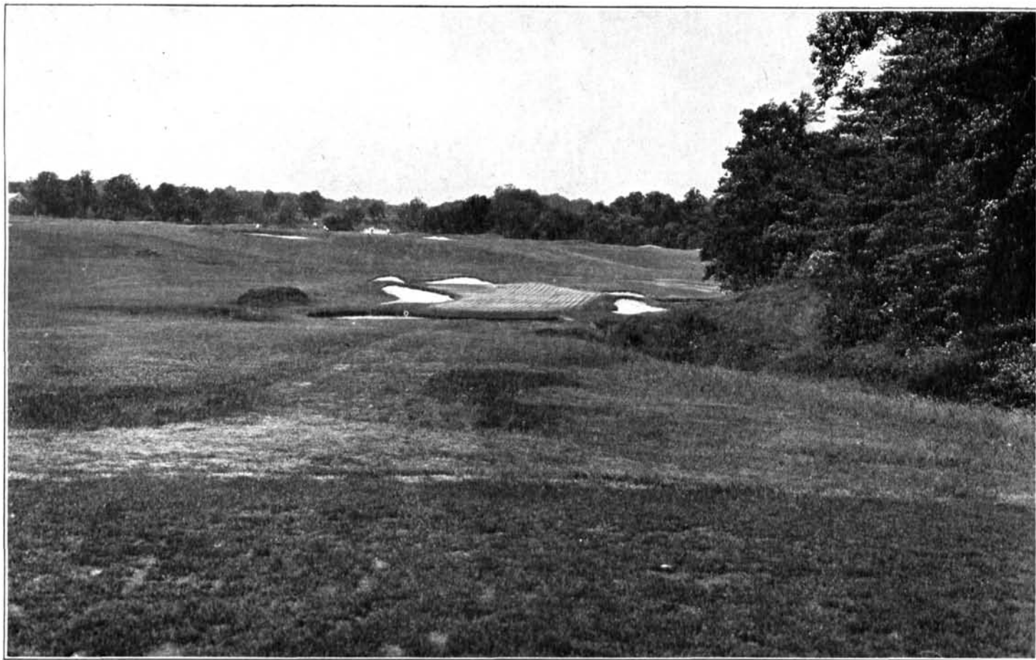
Hole No. 9, Merion Cricket Club (East Course). View from tee.