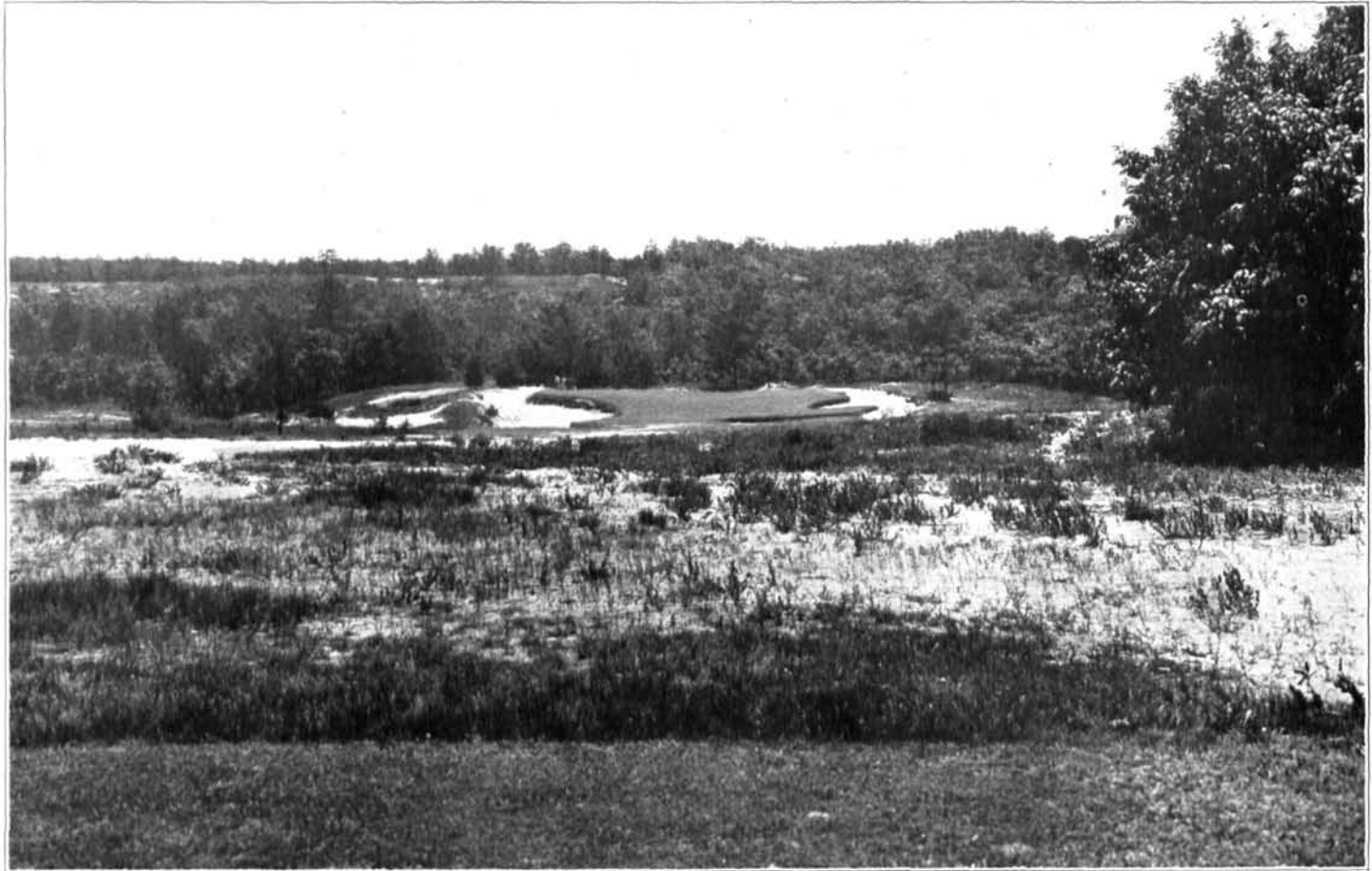
Hole No. 3, Pine Valley Golf Club. View from Tee.