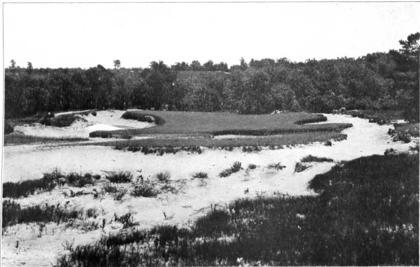
Hole N. 3, Pine Valley Golf Club. Close-up View of Putting Green.