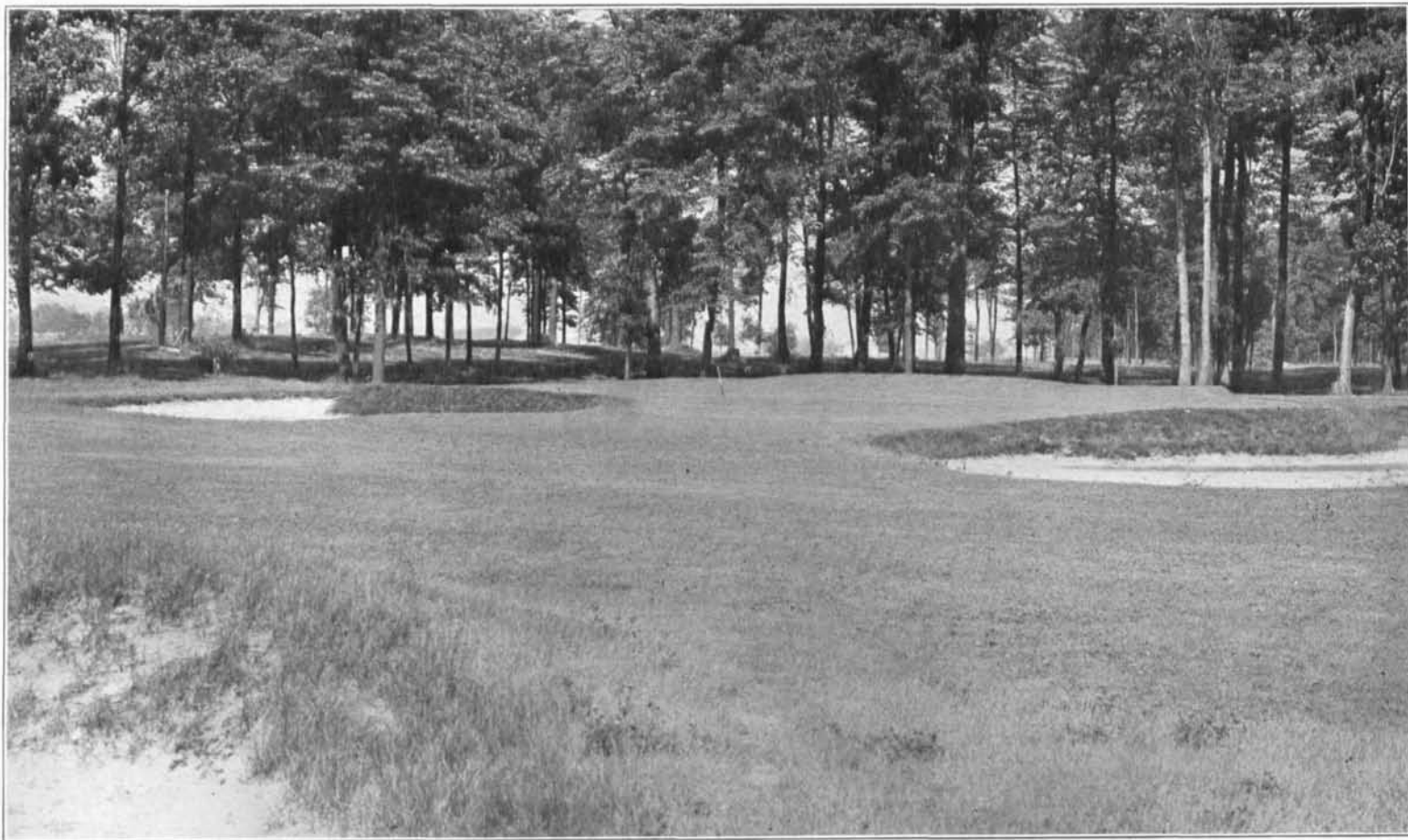
Hole No. 3, Inverness Club. Closeup View of Putting Green.