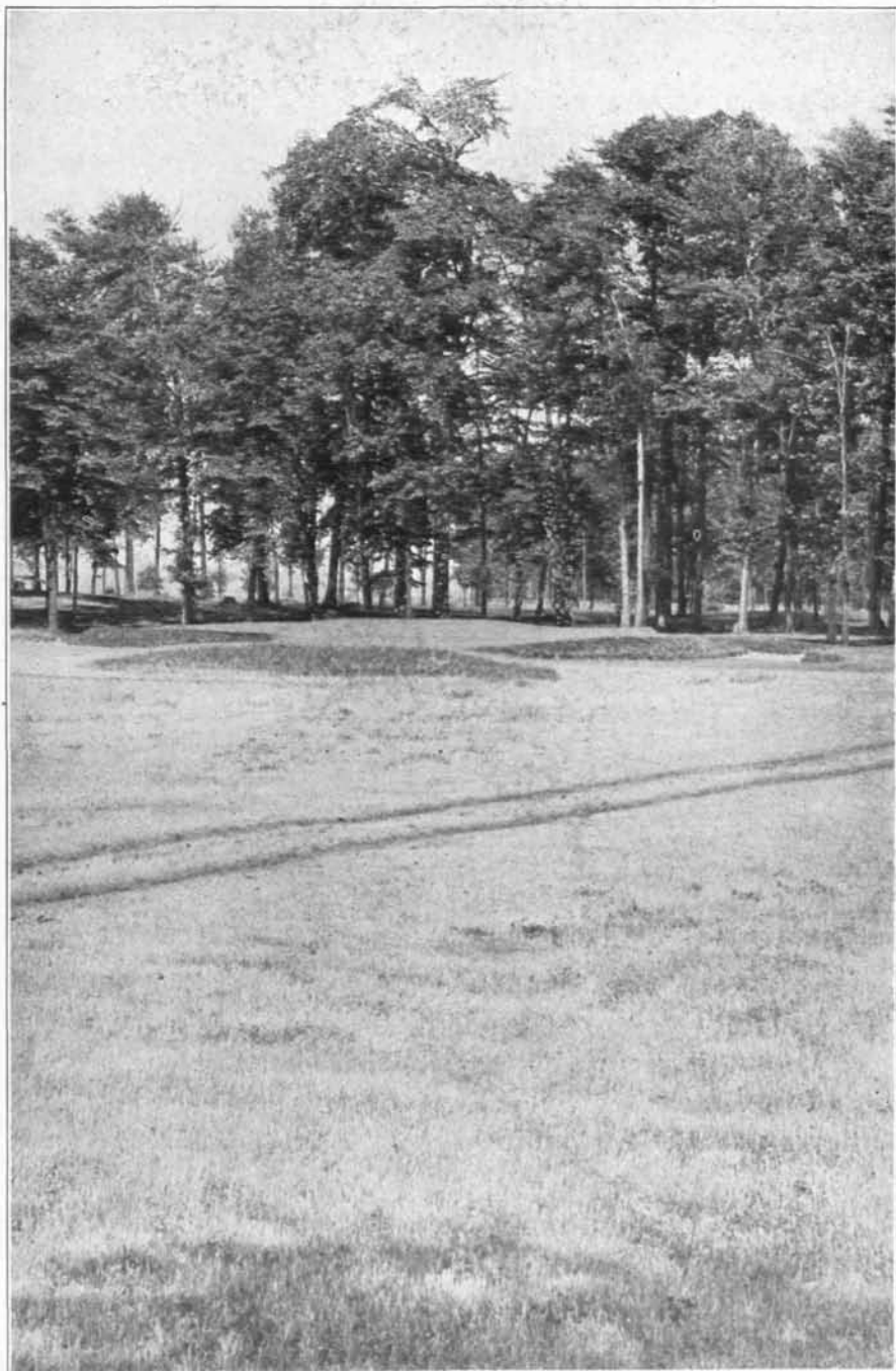
Hole No. 3, Inverness Club. View from Tee.