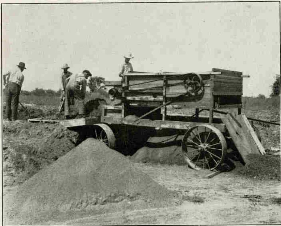
ROCKEFELLER'S COMPOST COMMUNUTOR

The outfit illustrated above was made out of an old thrashing machine which was purchased for $35. The Green Committee of Inverness got more in weight and volume for this particular $35 than it ever got for any other expenditure of double the amount of money. It certainly looked