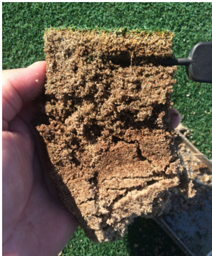
Two growing seasons after initiating a topdressing program that applied no less than 30 cubic feet of sand per 1,000 square foot annually, organic matter has decreased by 30 percent and surface performance has improved significantly.

gram that considers the sand type, application rate, and frequency is essential to achieve optimal playing surfaces.