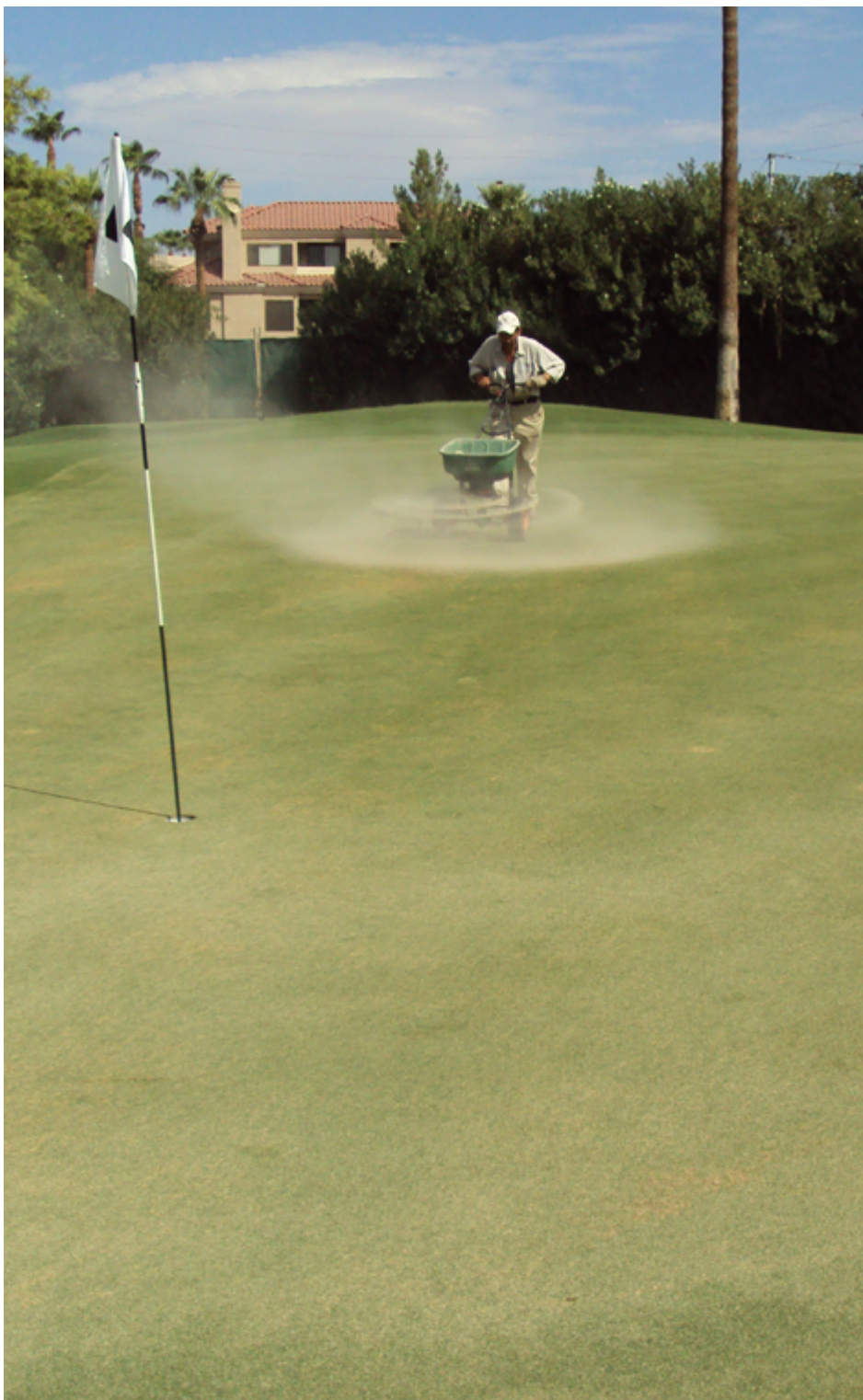
Light topdressing rates of 0.50 to 0.75 cubic feet of sand per 1,000 square feet are used during periods of minimal growth.

smoother and offer a better playing surface on the day of topdressing if the right sand is applied at a light rate.