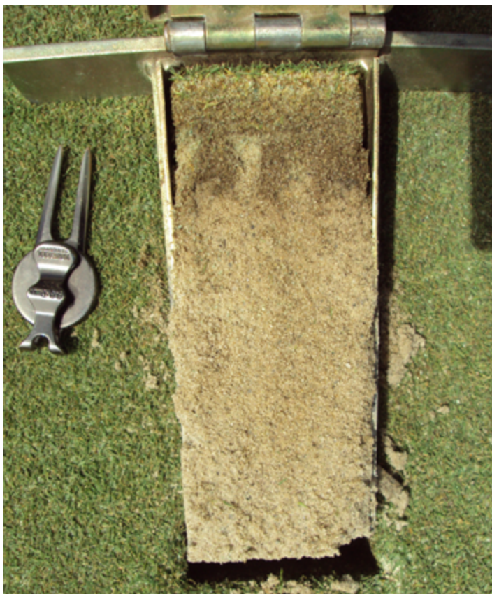
These creeping bentgrass greens were core aerated twice annually but received relatively infrequent topdressing. Organic matter accumulation caused soft conditions and localized dry spot.