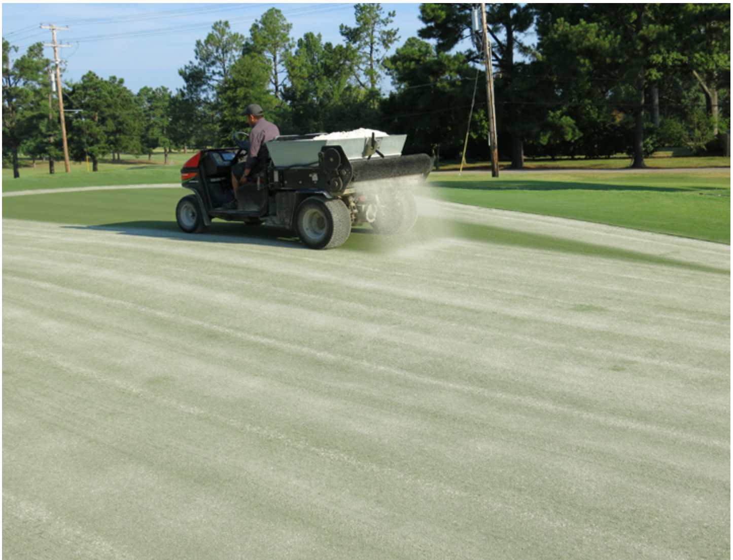
A drop-style topdresser can deliver sand to the putting surface with high precision. This operator is applying 1 cubic foot of sand per 1,000 square feet.

in diameter) and 15 to 40 percent in the coarse fraction (0.5-1.0mm in diameter). The fine sand fraction (0.15-0.25mm) should not exceed 25 percent, and the very fine fraction (0.05 - 0.15mm) should not exceed 5 percent. Ideally, the material should have no particles greater than 1.0 mm in diameter, given the difficulty in getting these larger particles to work down into the turf canopy. It is recommended to use a material with a coefficient of uniformity (CU) greater than 1.8. If the sand is too narrowly graded, which will produce a low CU, this may result in soft, unstable surfaces. However, the CU is not the only determining factor in stability — sand shape also plays a role, with angular sands being more stable. Utilizing a