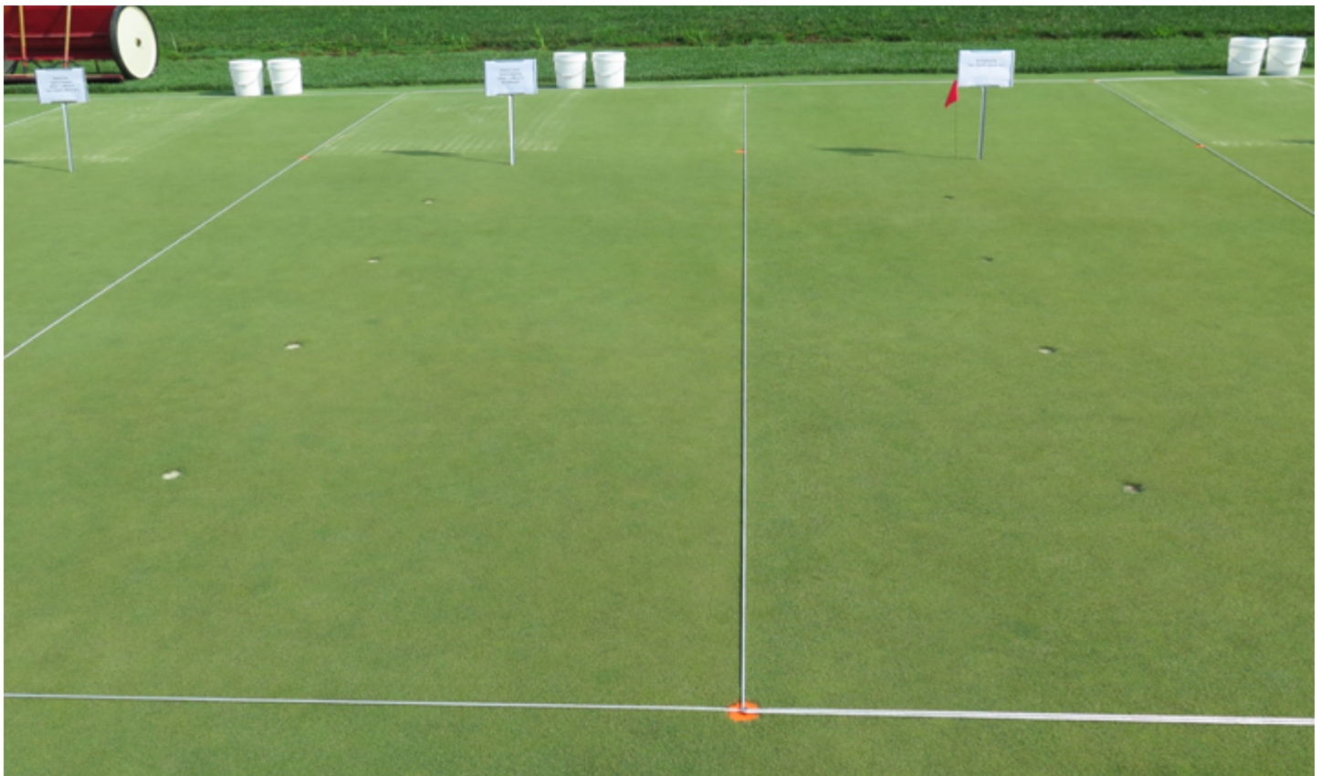
The medium-coarse sand topdressed plot on the left has significantly better turf density and lower surface moisture than the core-aerated, non-topdressed plot on the right, which is has darker green color due to surface algae.

There are two important rates to consider in a topdressing program: the sand application rate for each topdressing event and the annual rate achieved from the sum of all topdressing events, including sand applied to backfill aeration holes. The rate for an individual event must be considered simultaneously with application frequency because these factors are inversely related. As application frequency increases, the topdressing rate needed for each application decreases. The benefits of lighter rates include ease of application and incorporation, and reduced mower wear. Perhaps the greatest benefit is less disruption to the playing surface when compared to heavier sand application rates. In fact, one can argue that greens will be