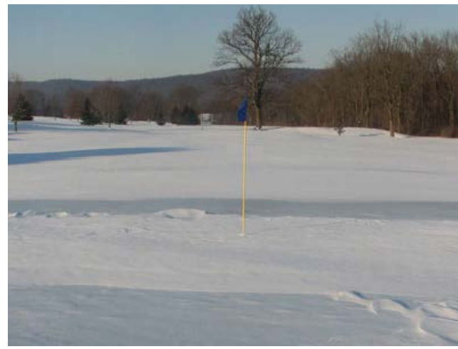
In some areas, snow and ice cover on putting greens can provide insulation to turf from direct low-temperature injury.

Applying the principles of turf science to common winter scenarios that arise on golf courses allows decision-makers to implement preventative measures, assess risk, and make informed decisions that provide an appropriate balance between the needs of the turf and the expectations of golfers.