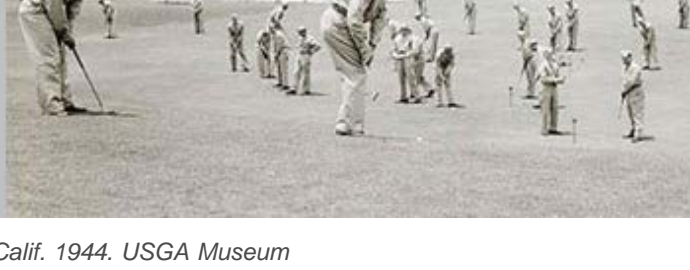
Army Golf. The Putting Green at Camp Gordon, Georgia, Calif. 1944.

FROM THE ARCHIVES WAR TIME MAINTENANCE MARCH, 1942 CLICK TO VIEW