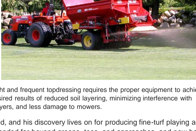
Light and frequent topdressing requires the proper equipment to achieve desired results of reduced soil layering, minimizing interference with players, and less damage to mowers.