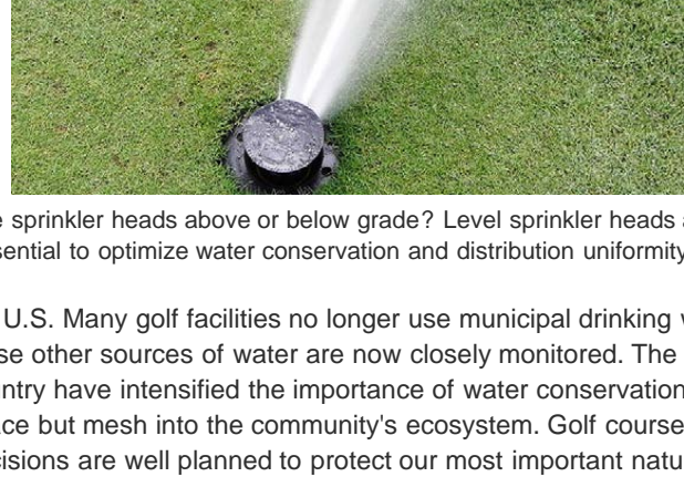
Are sprinkler heads above or below grade? Level sprinkler heads are essential to optimize water conservation and distribution uniformity.

Numerous issues challenge the game of golf today, including improving pace of play, growing the game, lowering costs to make golf more affordable and making the game more fun for players of all types. However, arguably the biggest challenge facing golf is water use. Efforts have long been underway to help reduce water used to maintain golf turf. A goal of the USGA for decades, both through the Turfgrass and Environmental Research Program and Course Consulting Service, has been to reduce the amount of water used on golf courses. Several examples, just to name a few, include breeding more drought-tolerant turfgrasses and promoting sound agronomic management practices.