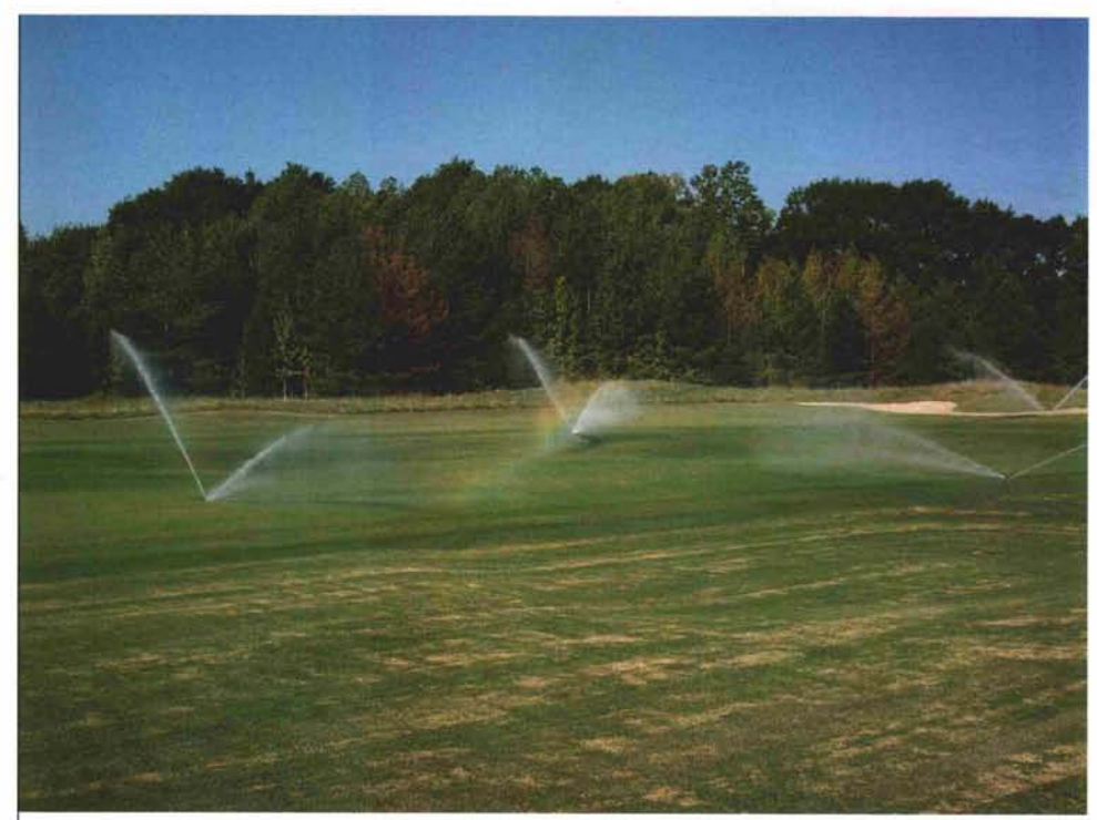
Fungicide applications are watered into the rootzone of Tifway bermudagrass at Old Waverly Golf Club, West Point, Mississippi.

Based on fungal isolation results, it has been determined that the frequency of occurrence of O. korrae was greatest