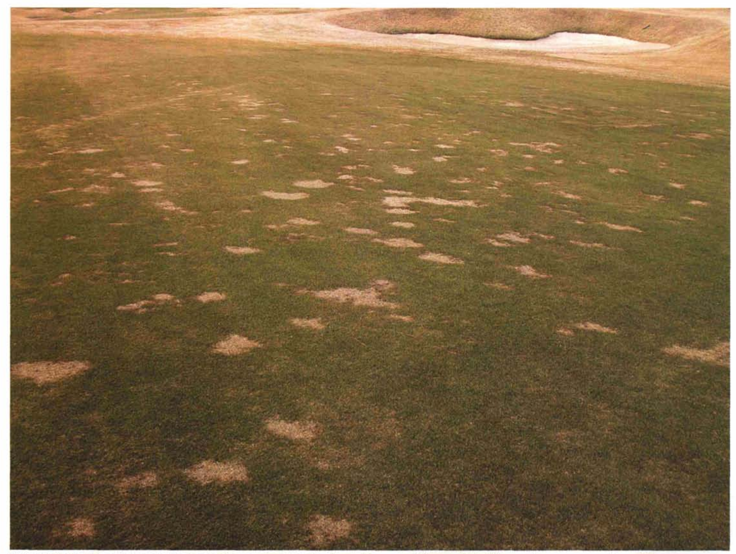
Spring dead spot is a serious root-rot disease of bermudagrass and is the most important disease of hybrid bermudagrasses managed as putting green and fairway turf.

during spring transition (9.4%) compared to summer (4.6%) and fall (3.1%) transition growth periods. As a result of the observed fungal activity in bermudagrass roots during spring transition, fenarimol (Rubigan) and other standard fungicides labeled for spring dead spot control are being applied to the symptomatic bermudagrass fairway in the spring and fall (Table 1). An organic or inorganic nitrogen source is being applied concurrently with fungicides to identify a fungicide/nitrogen source combination that may result in reduced spring dead spot incidence and severity while promoting high turf quality.