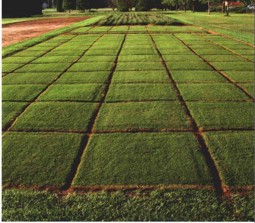
Promising experimental lines are grown in small replicated field plots where they are mowed and managed similarly to golf course fairways. In this preliminary trial, 37 seashore paspalum experimental lines are compared to commercial varieties for turf quality, density, texture, color, seed head production, and other important traits.

produces both stolons and rhizomes, has an intermediate to fine leaf texture, an attractive dark green color, good density, and good tolerance to low mowing. Seashore paspalum is considered to be the most salt-tolerant warm-season turfgrass species and also holds great promise for reclamation and soil stabilization of unmanaged salt-affected sites.