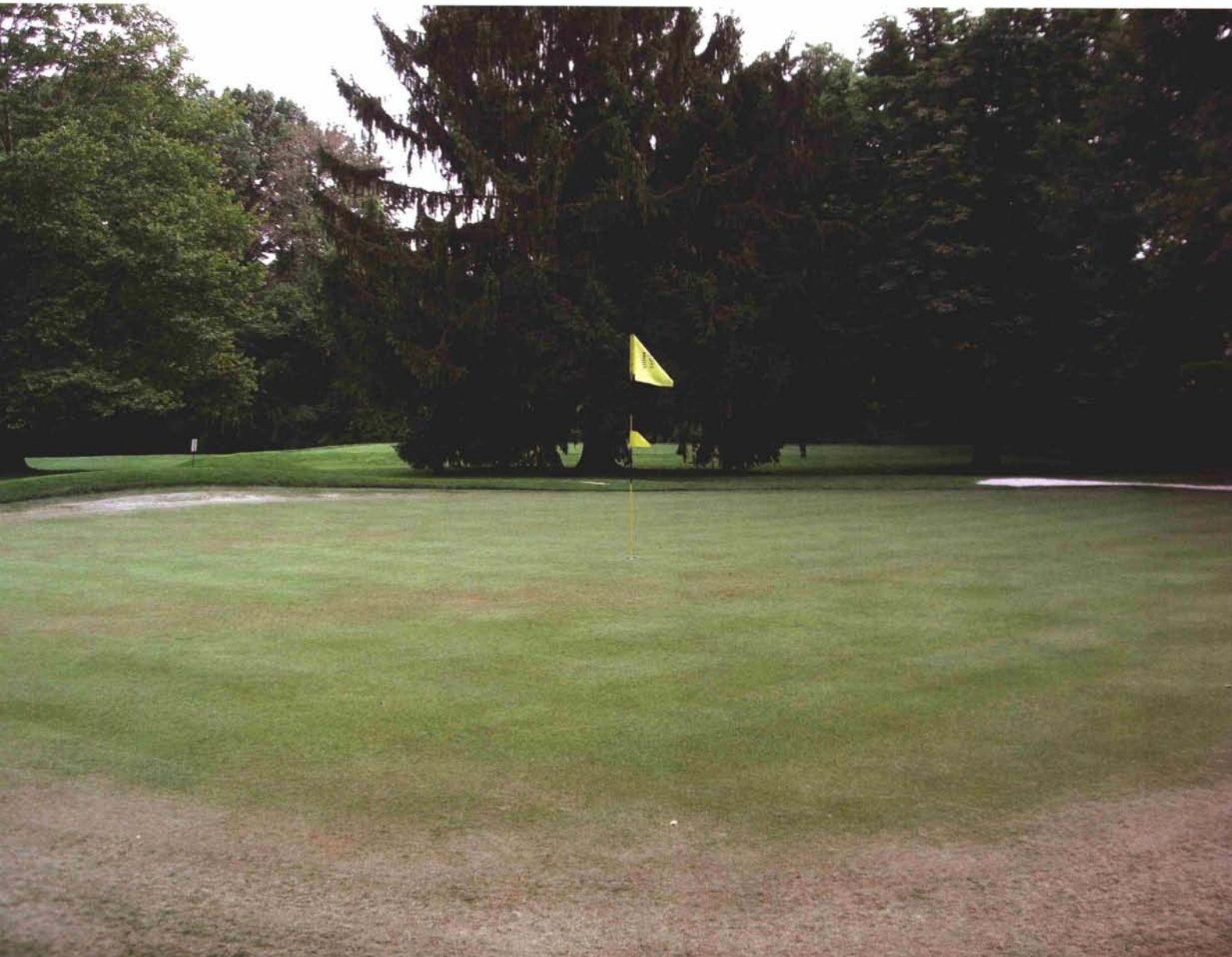
Disease activity typically starts first in high-stress areas such as the perimeter of greens that were recently expanded or within the mower cleanup pass.

Hanson, K. V., and B. E. Branham. 1987. Effects of four growth regulators on photosynthate partitioning in "Majestic" Kentucky bluegrass. Crop Sci. 27:1257-1260.