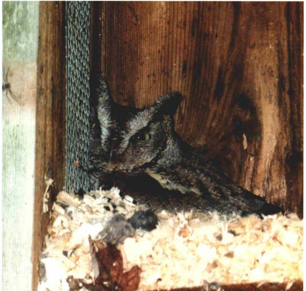
LaPlaya Golf Club.