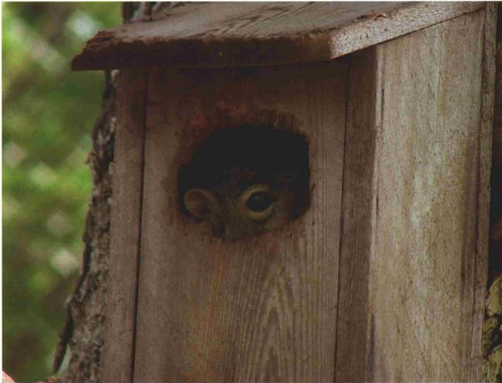
Mesquite Grove Golf Course.

Resources Manager Kim Walton, and the crew at Mesquite Grove have converted more than 15 acres of formerly managed turfgrass into natural habitat areas. The taller grasses, along with pre-existing woods, meadows, and lakes provide food and shelter for more than 100 species of birds, 14 mammals, and 18 species of reptiles and amphibians. Among the menagerie is the largest member of the tree squirrel group — the fox squirrel. Fox squirrels prefer woodland borders, where they feed on nuts, seeds, and fruit. The one in the photograph laid claim to one of the course's 30 nest boxes. Fox squirrels generally have two litters of three to five young each year.