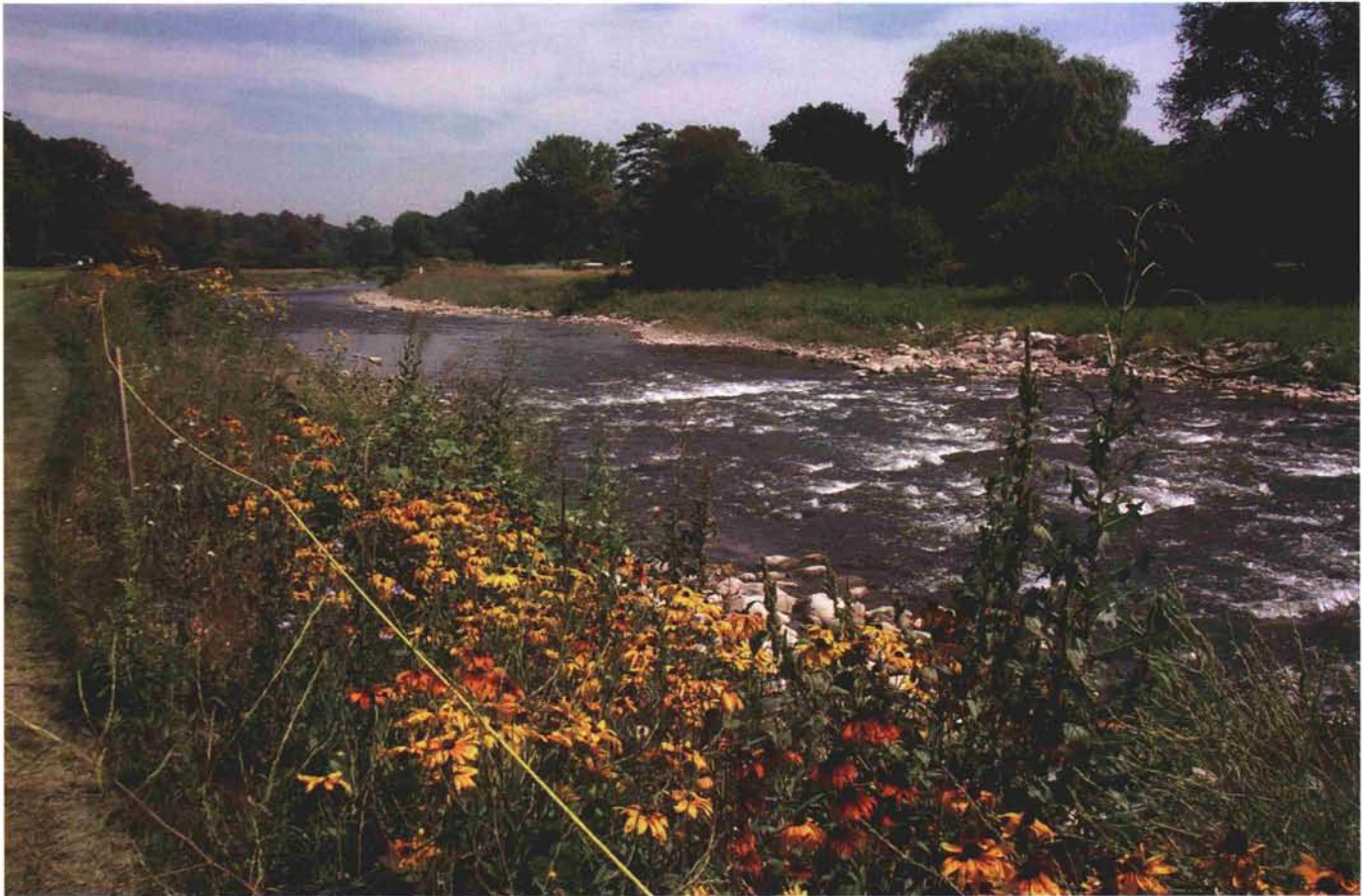
Mississauga Golf and Country Club.