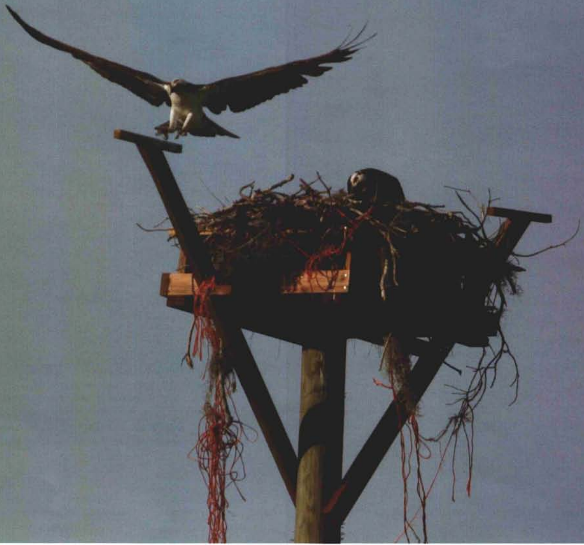
Hole-in-the-Wall Golf Club.