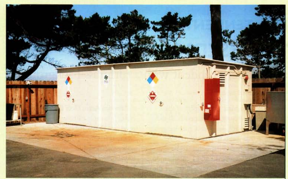
What did your golf course spend last year on fertilizers and pesticides to maintain the golf course? Efficient utilization of these resources through an Integrated Pest Management program impacts the bottom line.

tion to where and how you use water, you'll save money from washing down the drain.